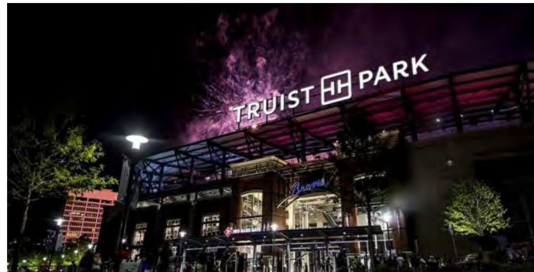
Trust Park in The Battery Atlanta