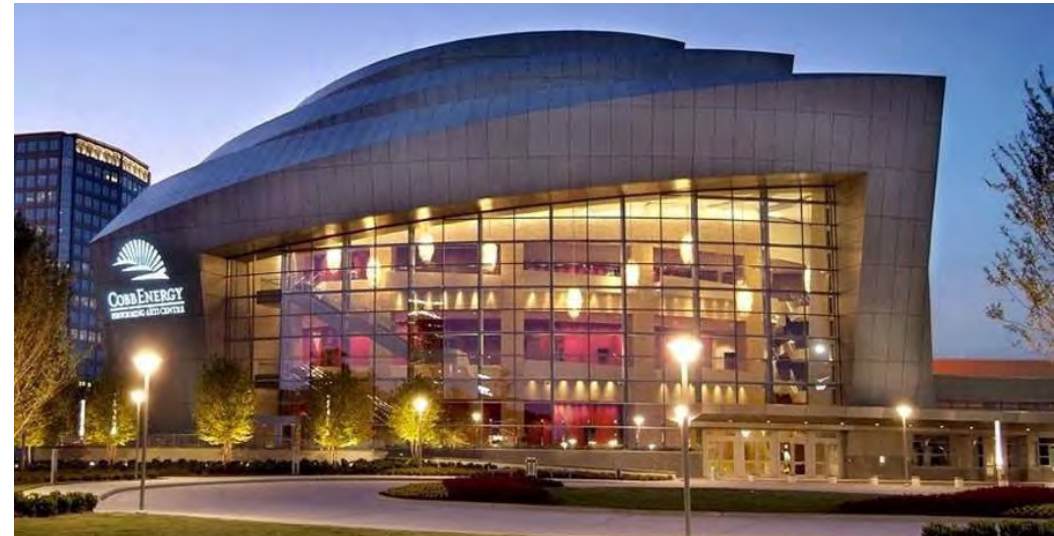
Cobb Energy Performing Arts Centre