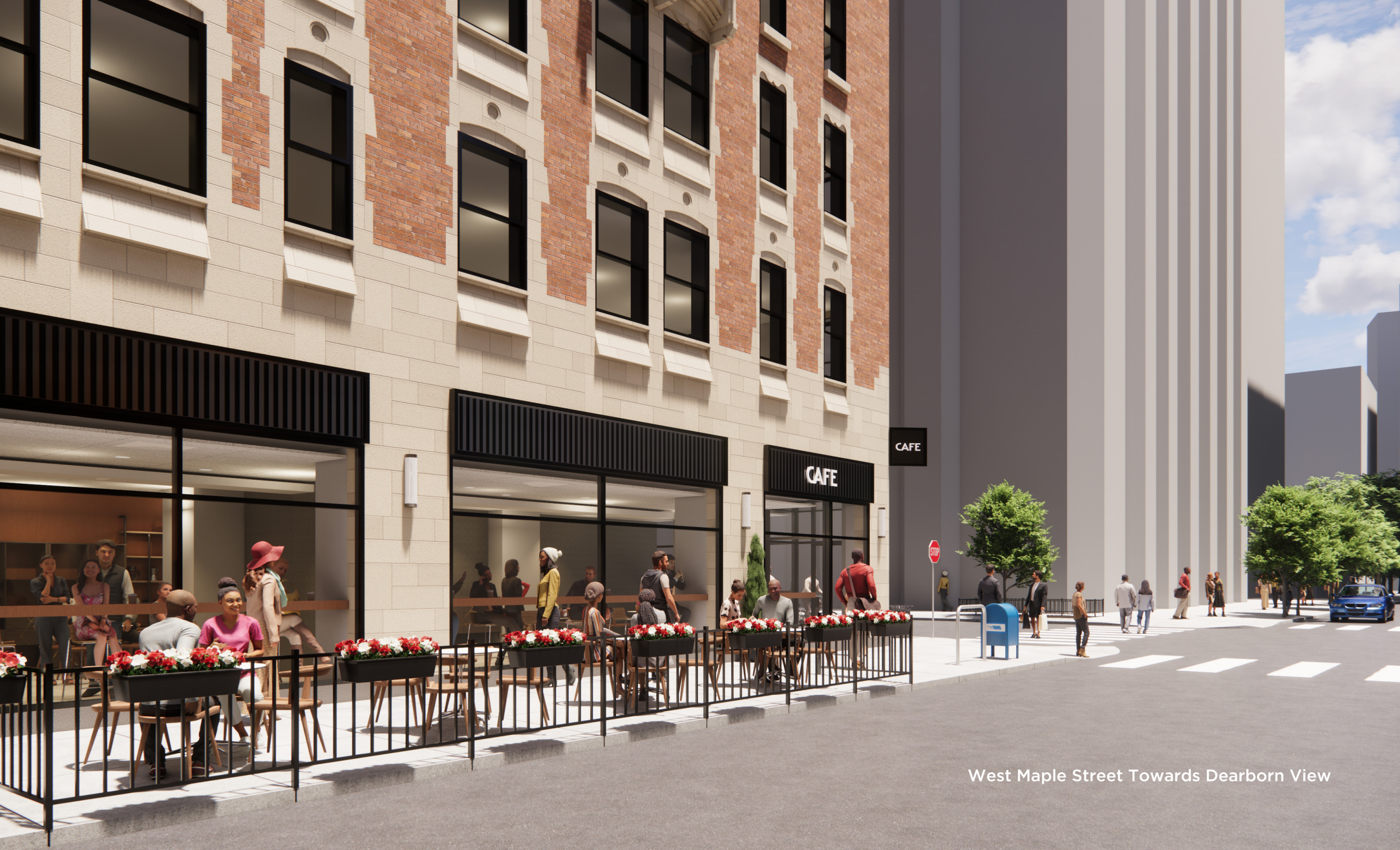
West Maple Street Towards Dearborn View