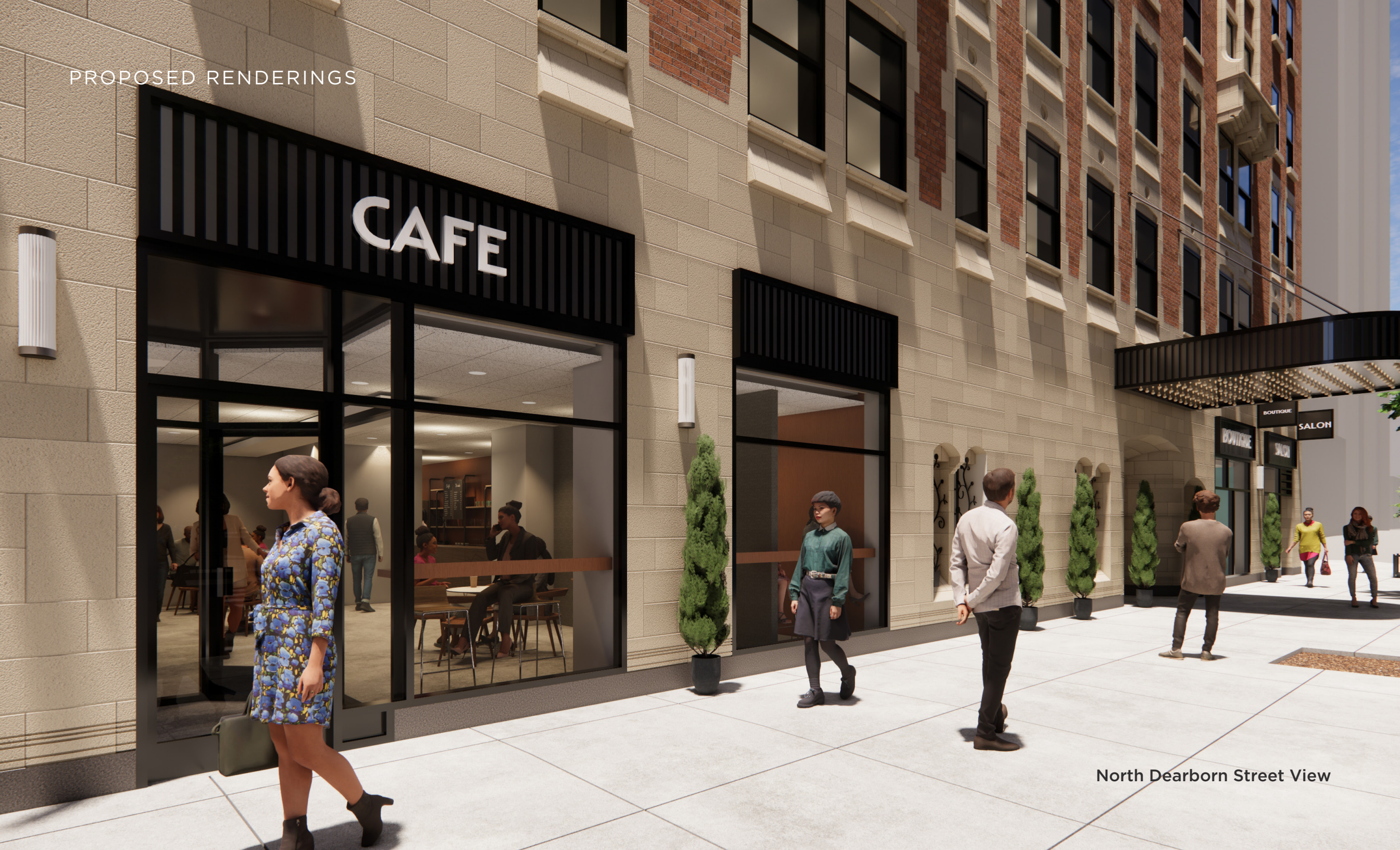
North Dearborn Street View