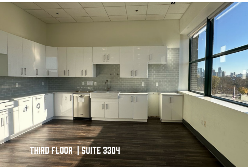
THIRD FLOOR | SUITE 3304