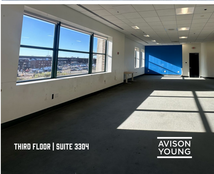
THIRD FLOOR | SUITE 3304