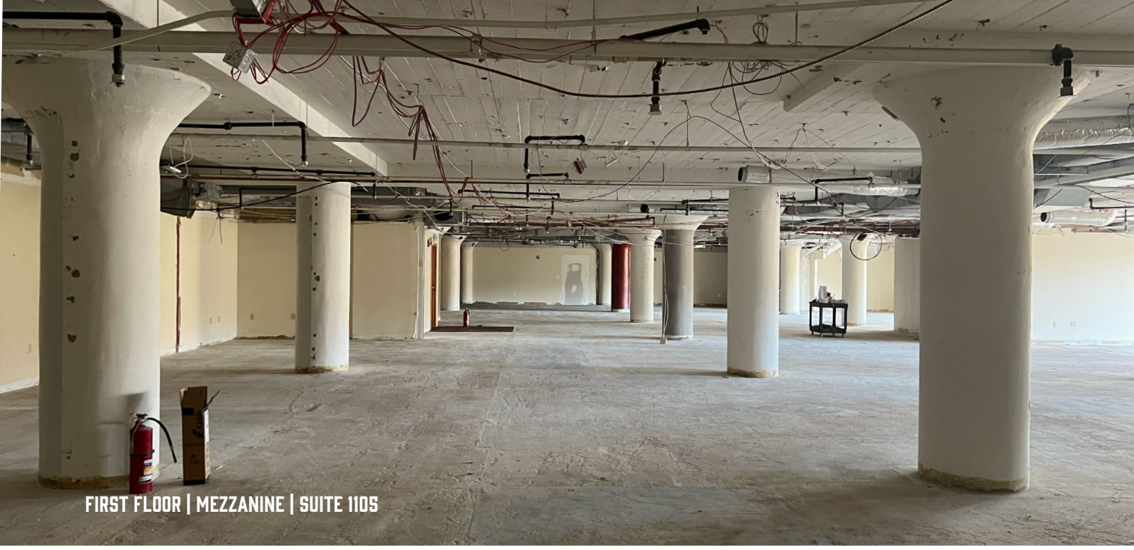
FIRST FLOOR | MEZZANINE | SUITE 1105