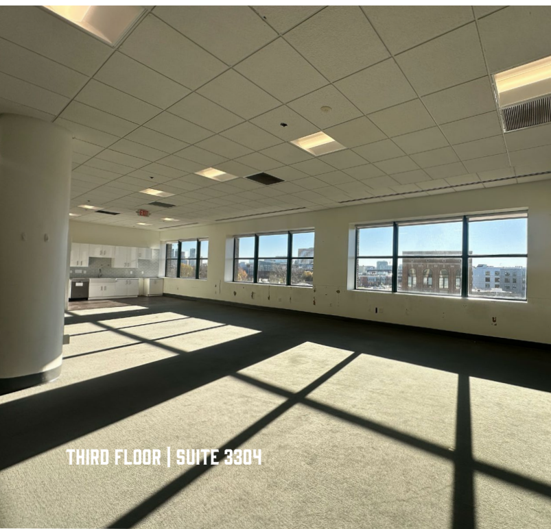
THIRD FLOOR | SUITE 3304