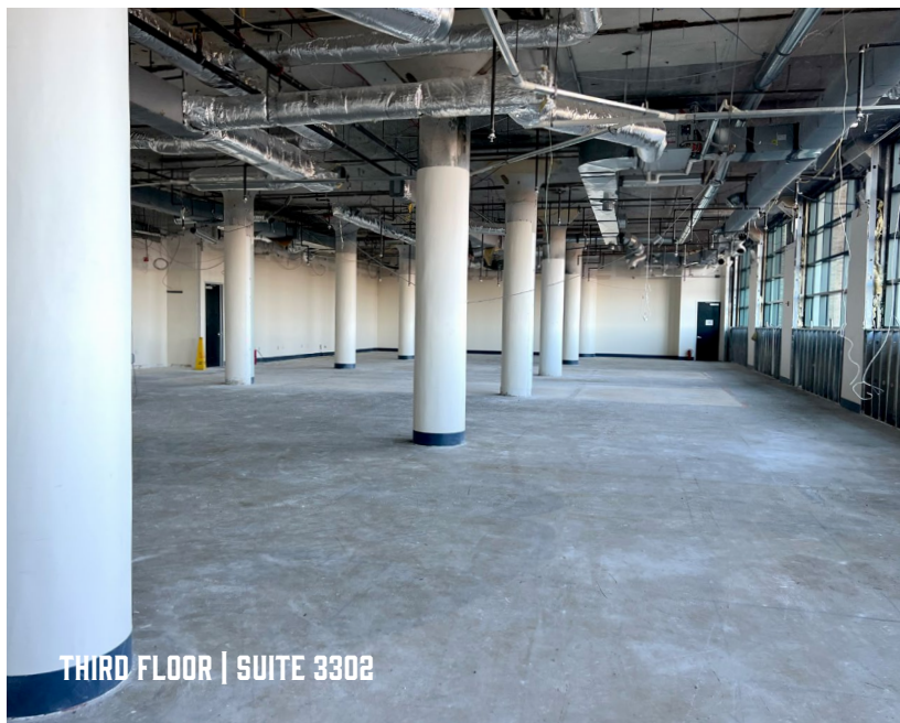
THIRD FLOOR | SUITE 3302