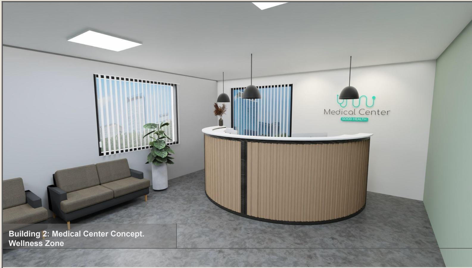
Building 2: Medical Center Concept. Wellness Zone