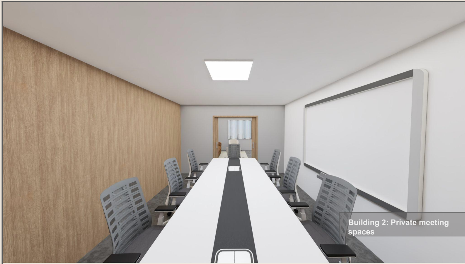
Building 2: Private meeting spaces