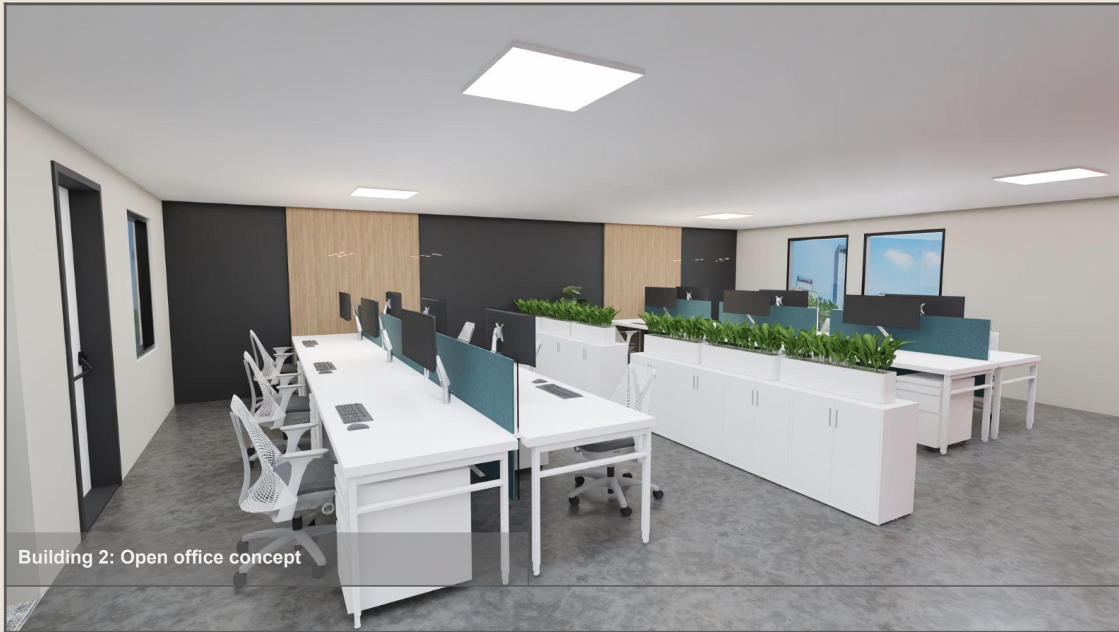
Building 2: Open office concept