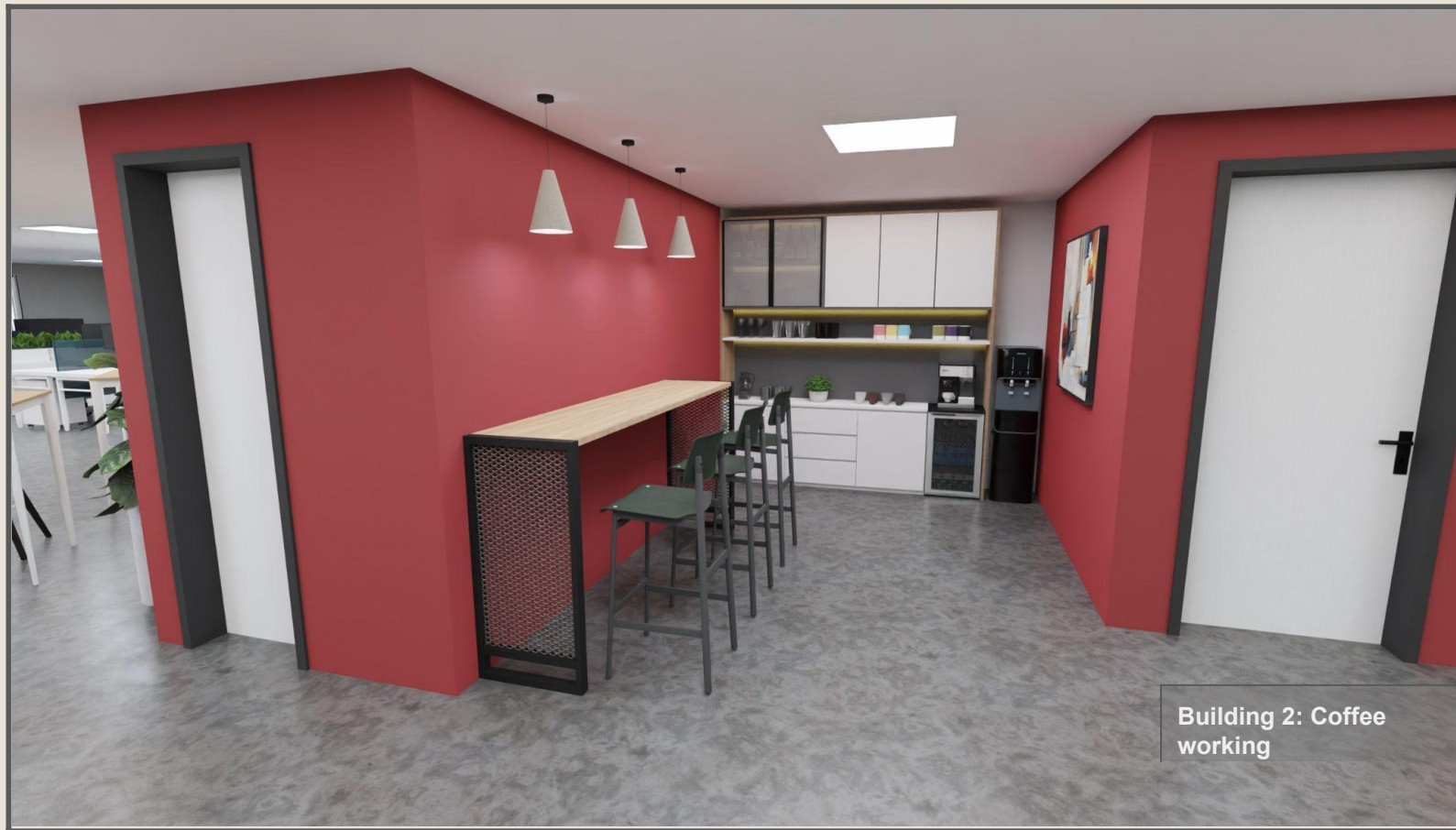
Building 2: Coffee working