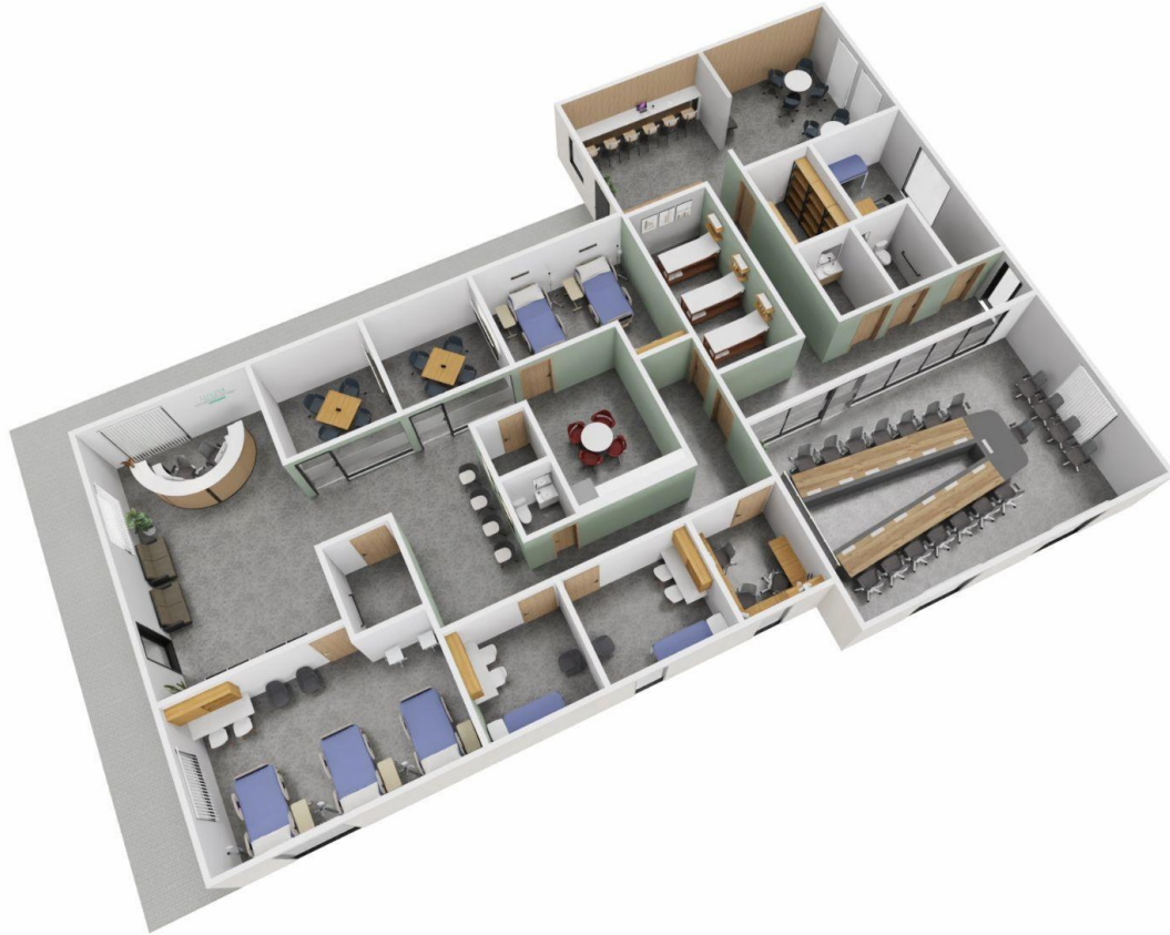
View 8 - Aerial Perspective