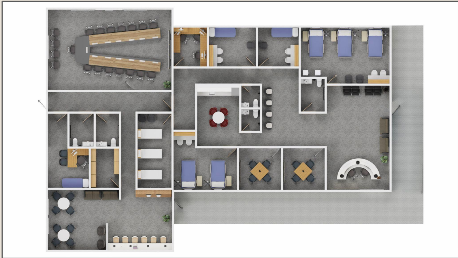
View 7 - Top View