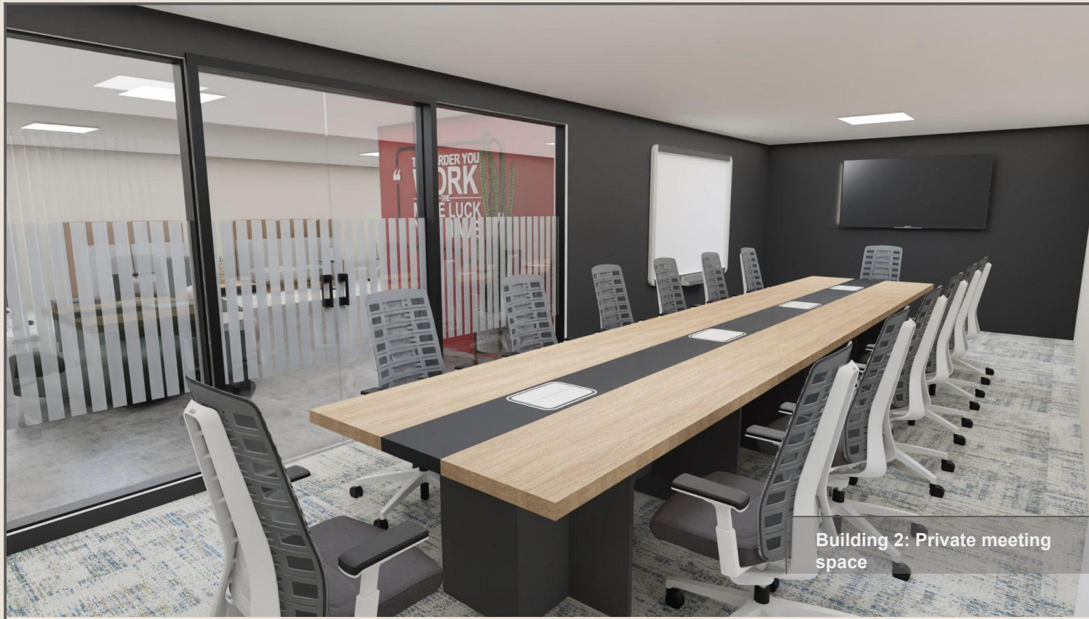
Building 2: Private meeting space