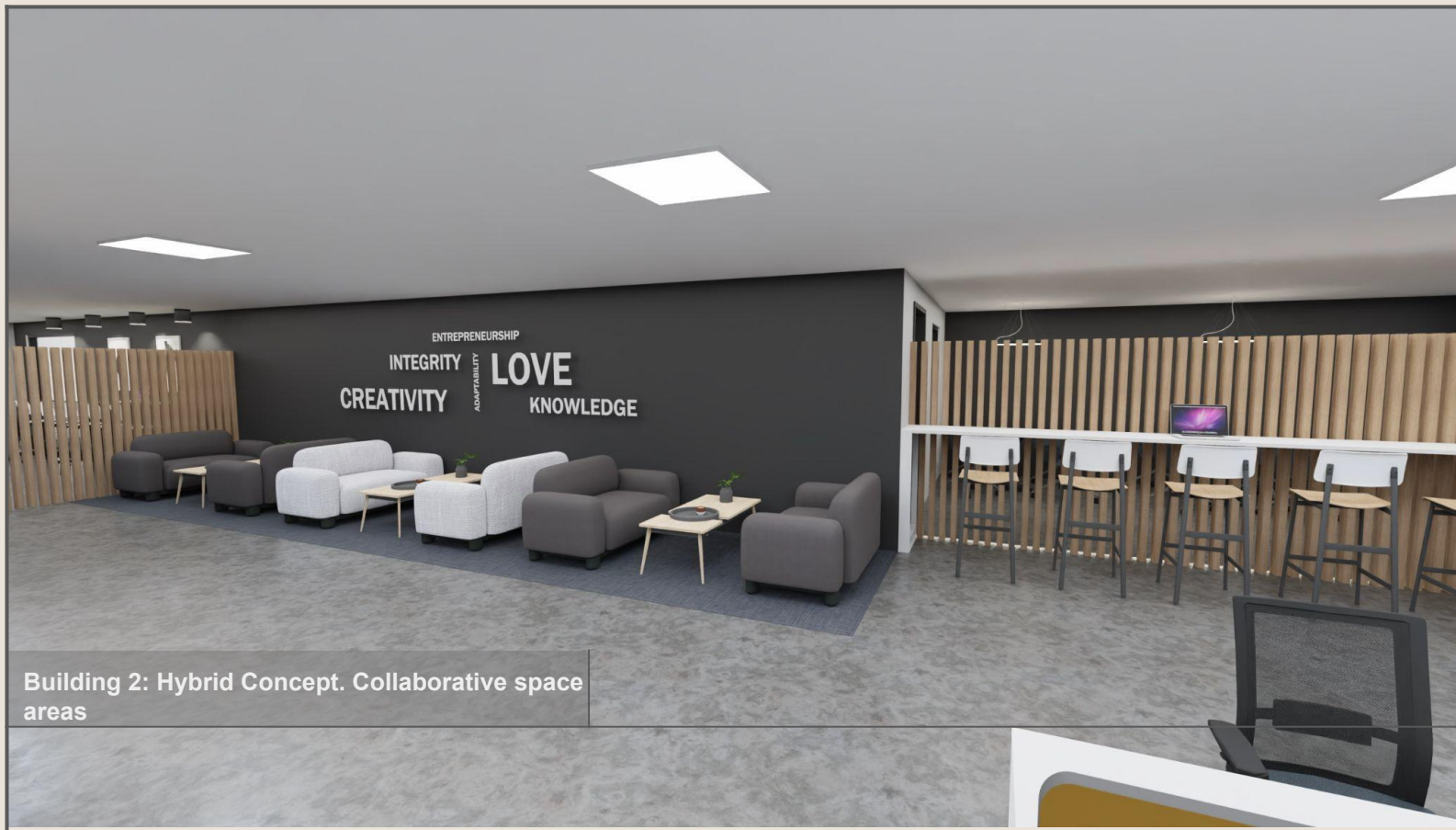
Building 2: Hybrid Concept. Collaborative space areas