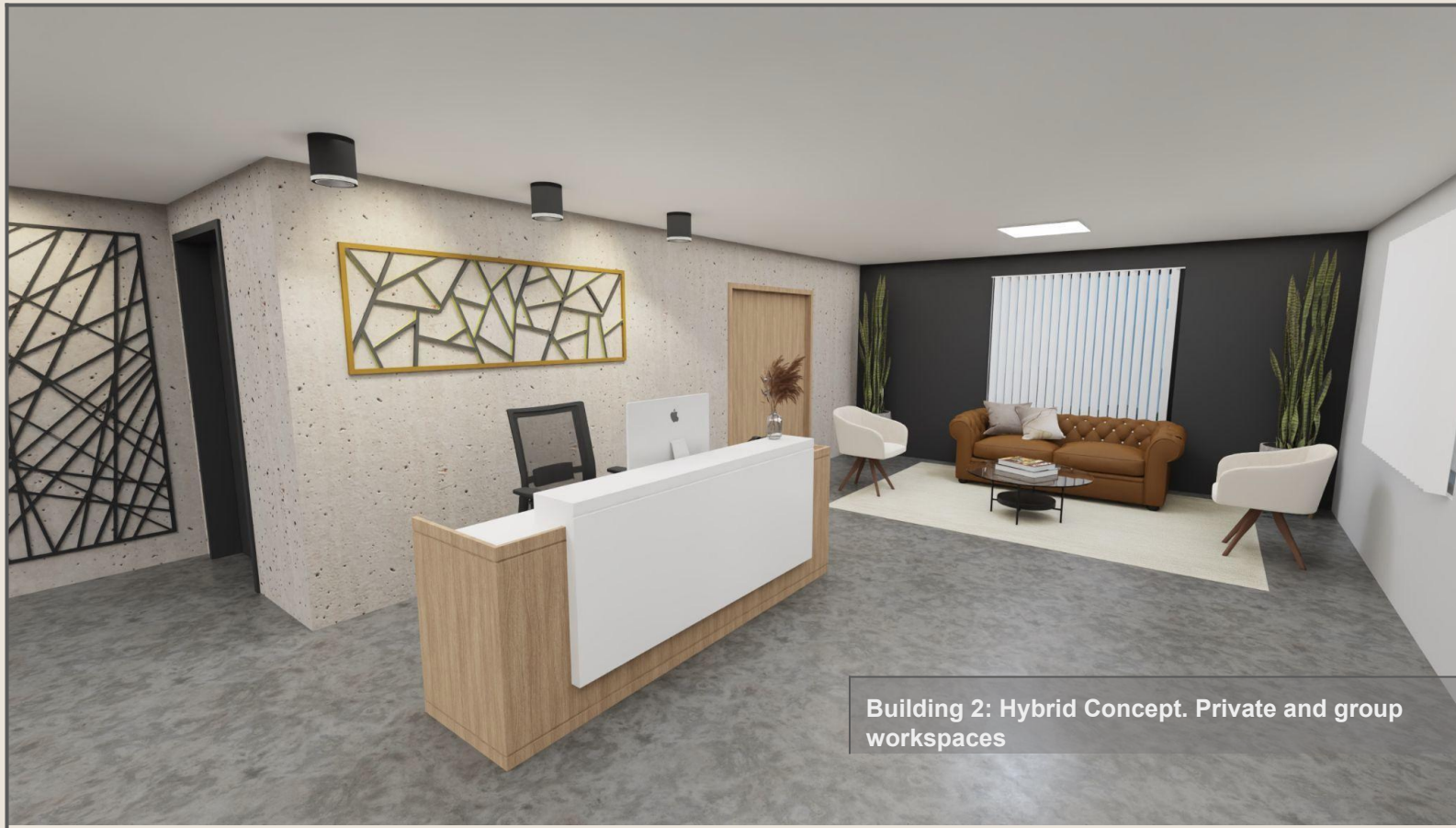
Building 2: Hybrid Concept. Private and group workspaces