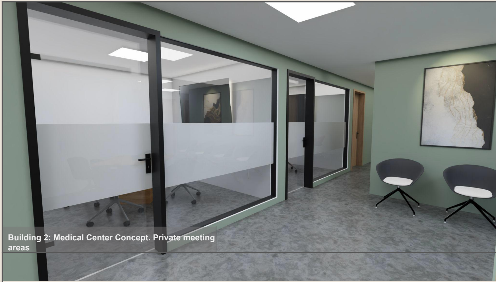
Building 2: Medical Center Concept. Private meeting areas