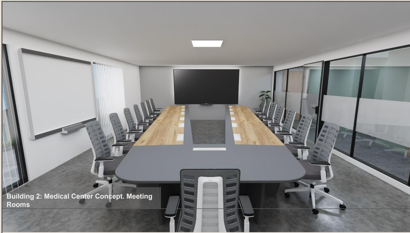
Building 2: Medical Center Concept. Meeting Rooms