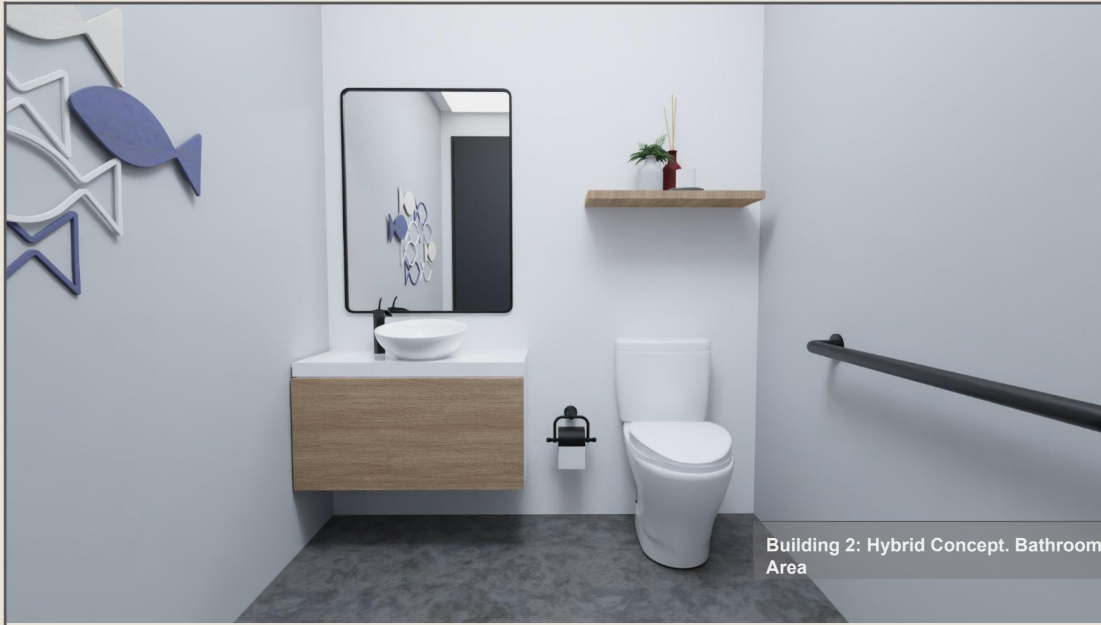
Building 2: Hybrid Concept. Bathroom Area