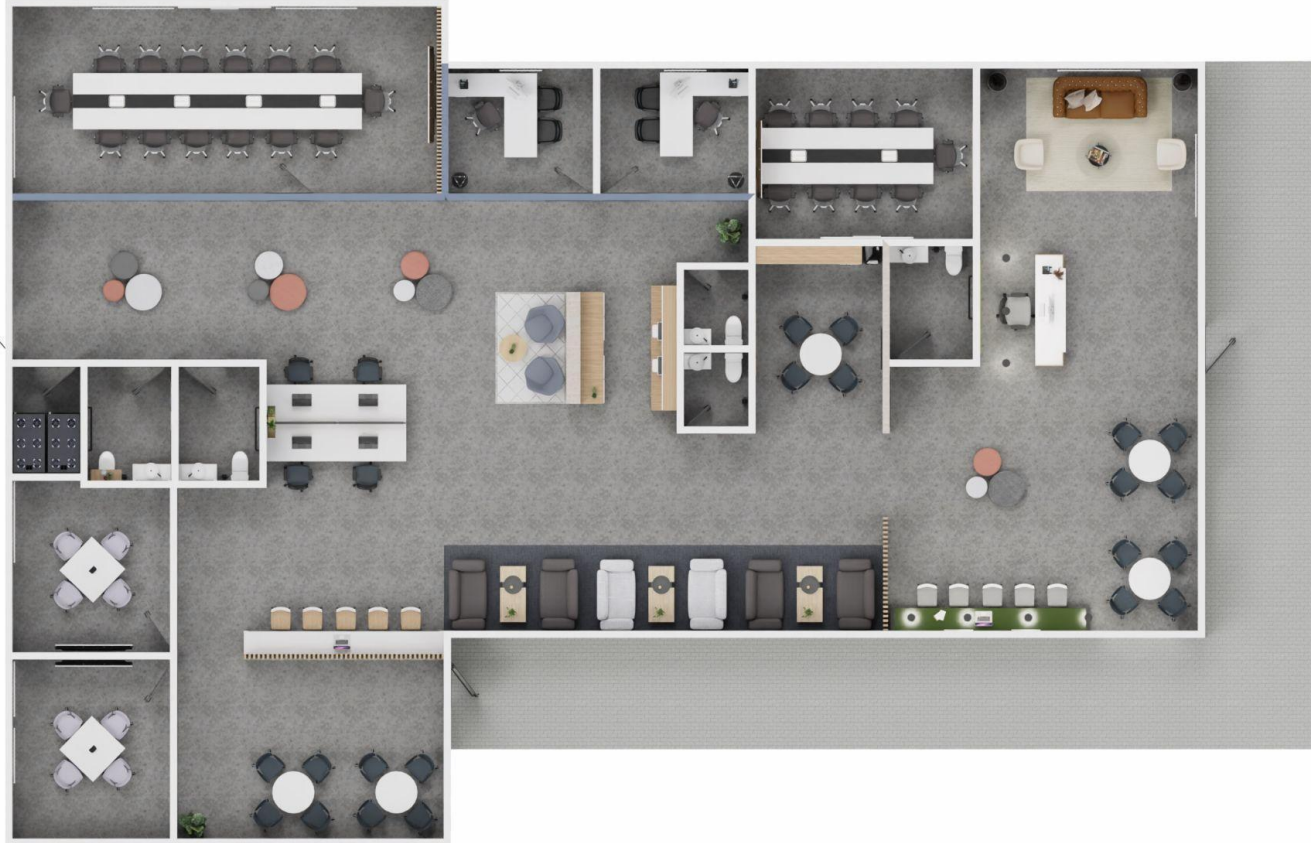
View 7 - Top View