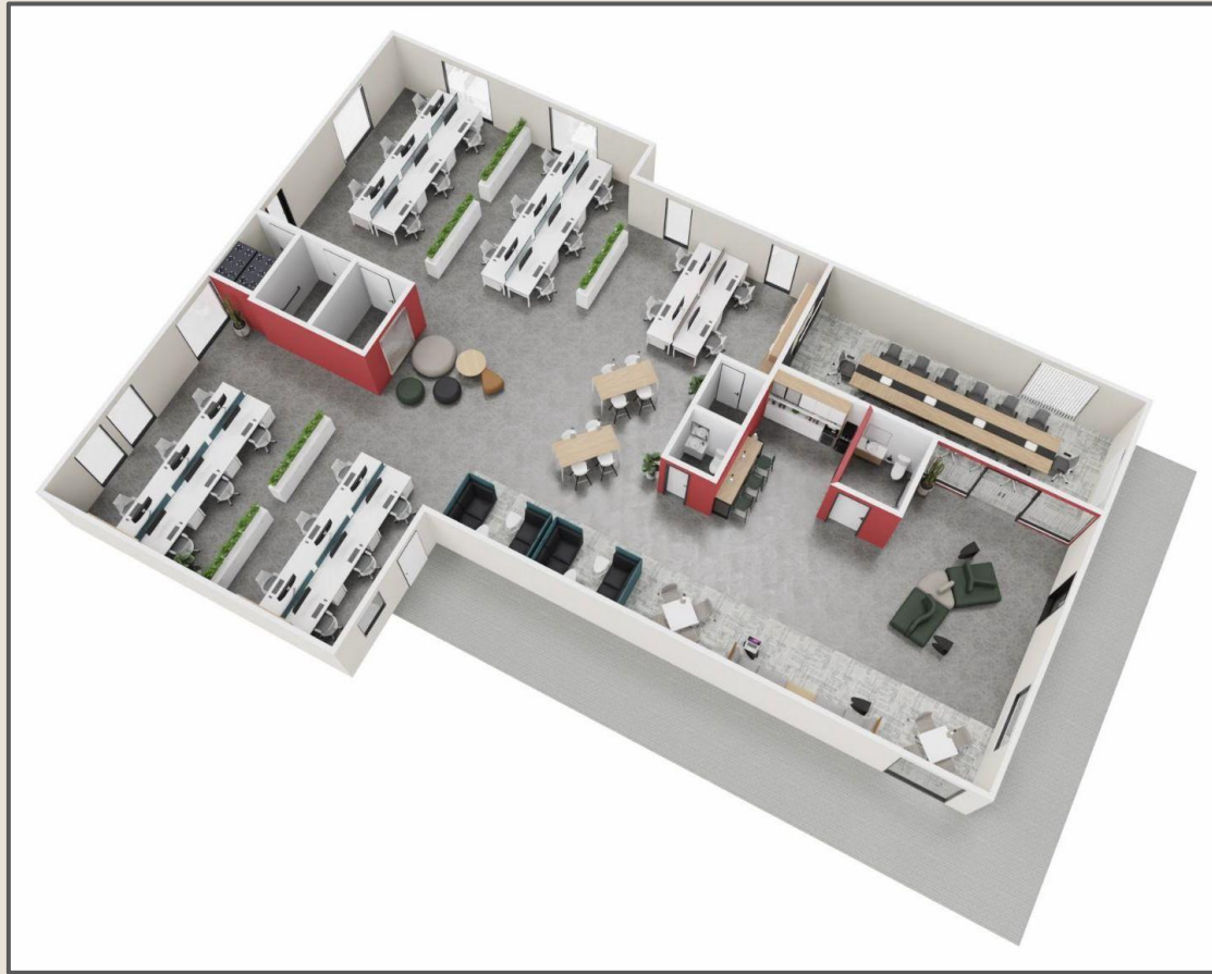
View 8 - Aerial Perspective