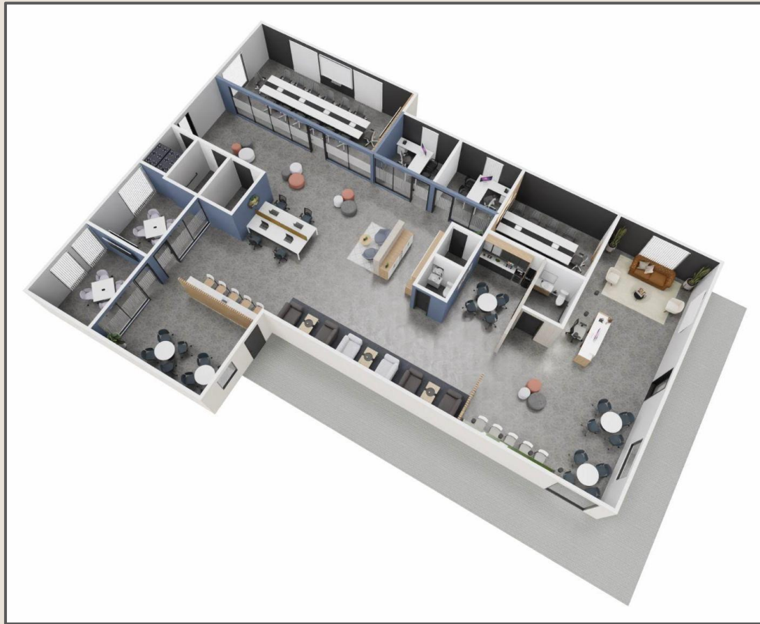
View 8 - Aerial Perspective