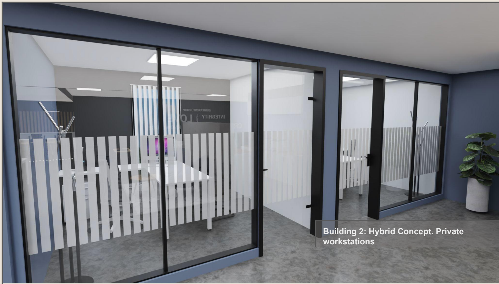
Building 2: Hybrid Concept. Private workstations