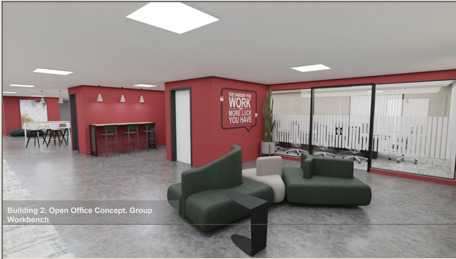
Building 2: Open Office Concept. Group Workbench