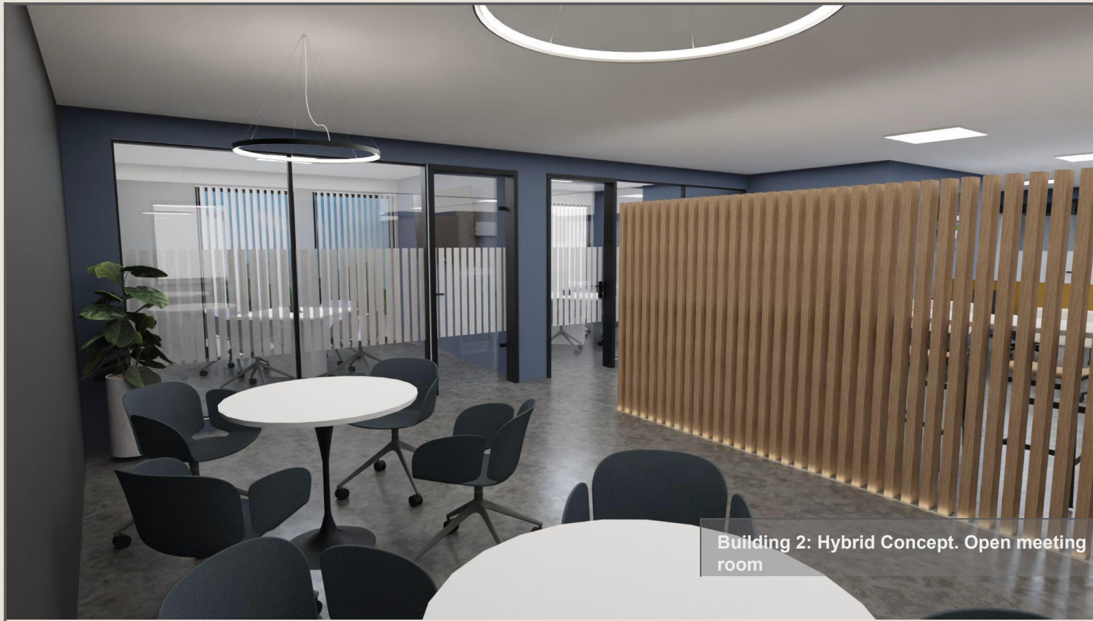
Building 2: Hybrid Concept. Open meeting room