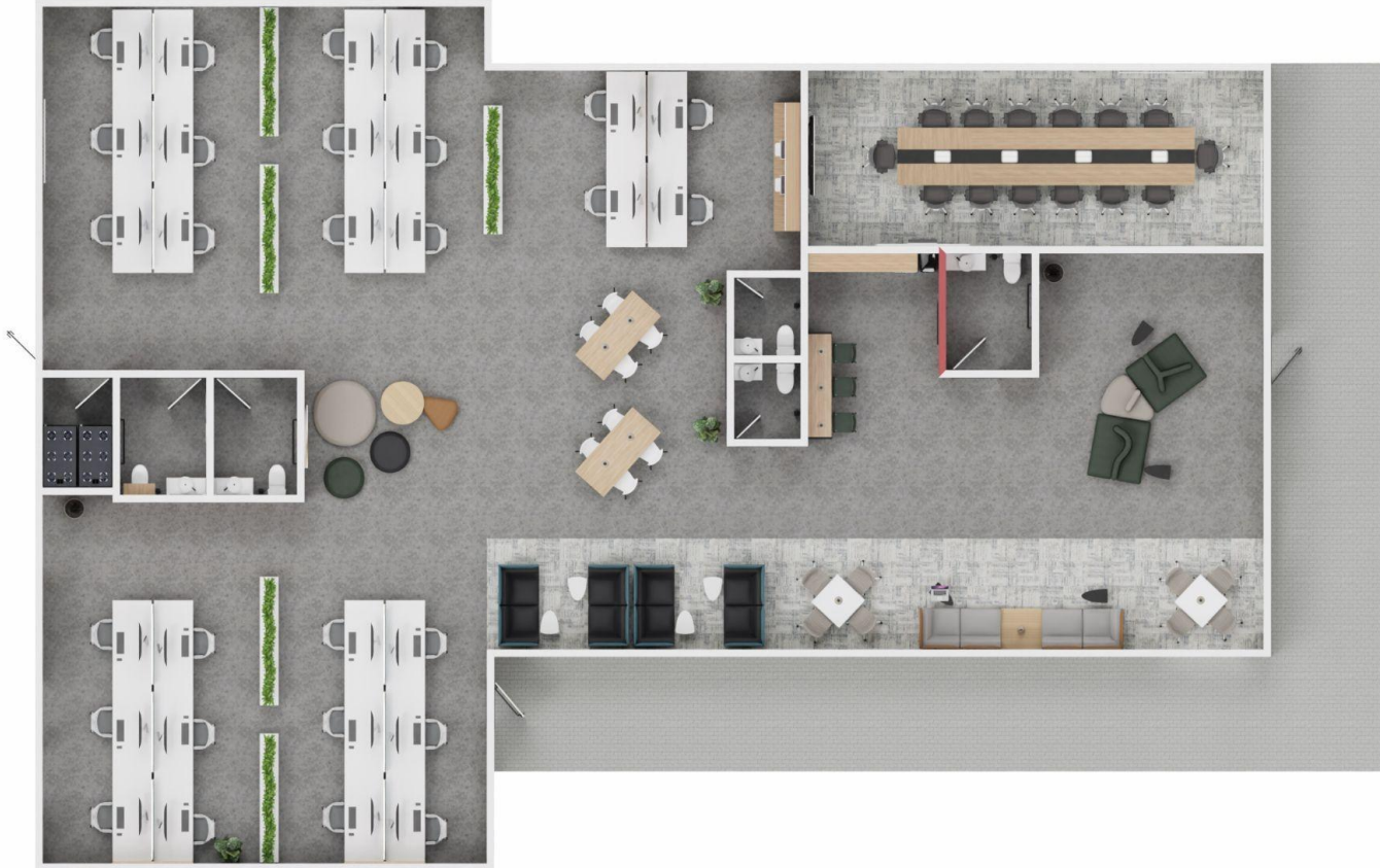
View 7 - Top View