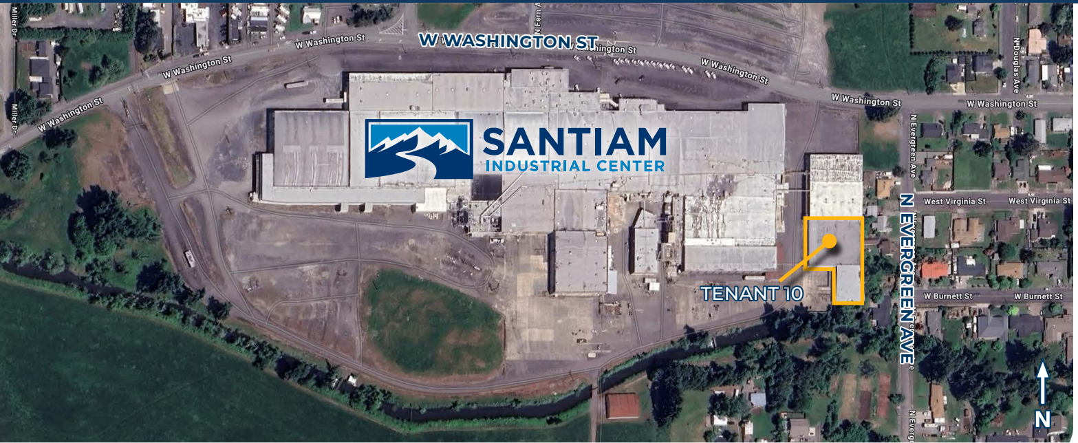
Map data ©2024 Google Imagery ©2024, Airbus, CNES / Airbus, Maxar Technologies, Metro, Portland Oregon, Public Laboratory, State of Oregon, U.S. Geological Survey, USDA/FPAC/Geo