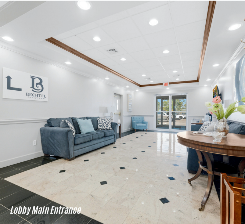
Lobby Main Entrance