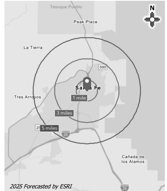
2025 Forecasted by ESRI

223 & 225 Johnson St. Santa Fe, NM 87501