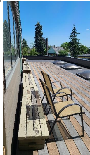
600 sq.ft.* sundeck (*Approximate size)