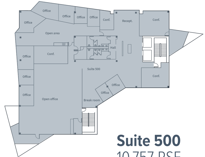
Suite 500 10,757 RSF