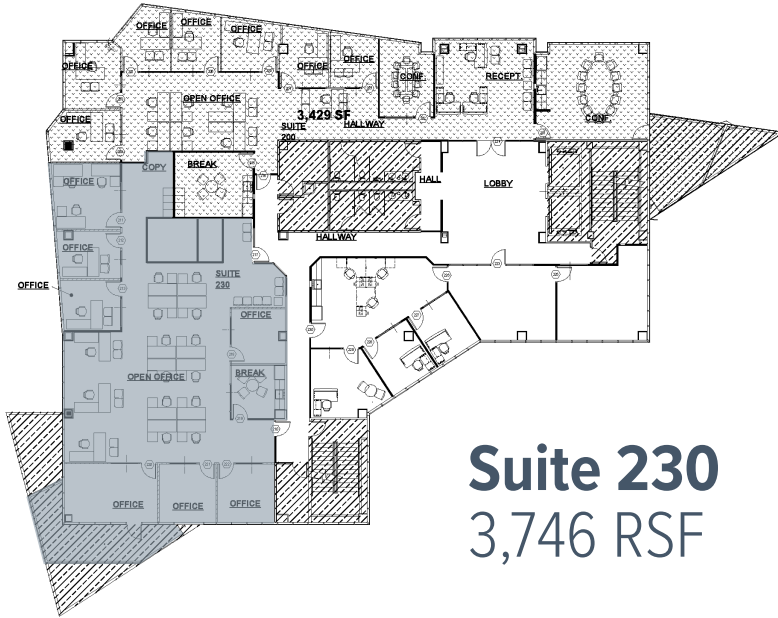
Suite 230 3,746 RSF