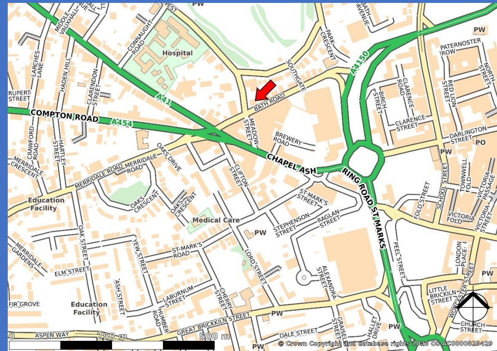
Scale: Not to Scale

Interested parties are advised to make their own enquiries with the relevant utility companies.