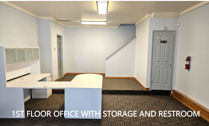
1ST FLOOR OFFICE WITH STORAGE AND RESTROOM