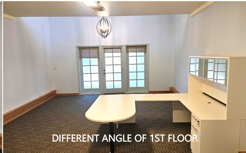
DIFFERENT ANGLE OF 1ST FLOOR