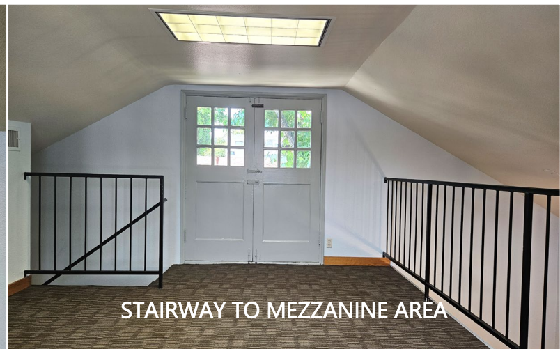
STAIRWAY TO MEZZANINE AREA