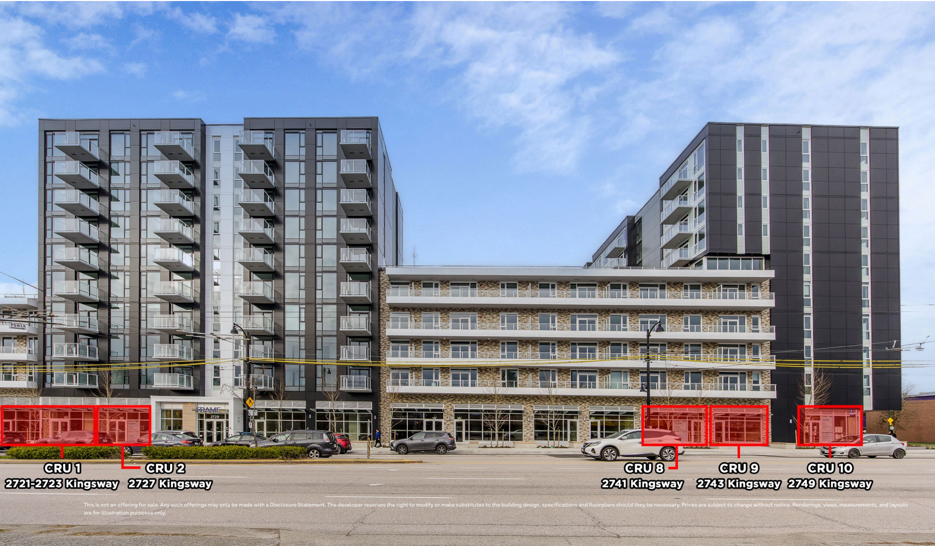
CRU 1 2721-2723 Kingsway CRU 2 2727 Kingsway

A masterclass in the fundamentals of good real estate, Frame is your first opportunity to own in Vancouver's next great urban centre. A prime, corner location located at Kingsway and Earles, across from a future city plaza. Frame's retail ownership opportunities range from 567 SF to 6,362 SF with the option to combine units to best fit your business needs. Make this space your own, with designated patio spaces, ceilings up to 13'-18' tall, and expansive window opportunities to fill each unit with plenty of natural light. The future growth of this exceptional location is set to bring more residents to this already busy area.