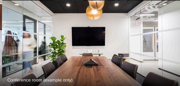
Conference room (example only)