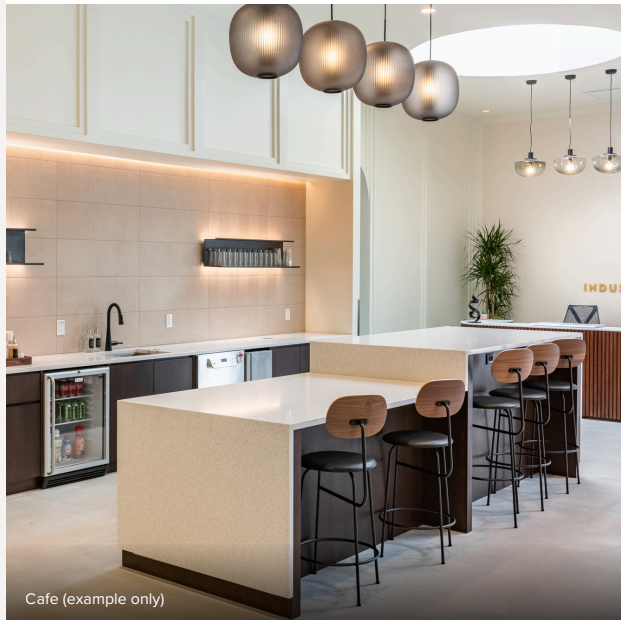
Cafe (example only)