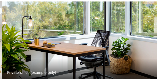
Private office (example only)