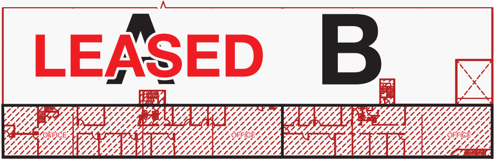
UPPER FLOOR OFFICE

UNIT B Ground Floor: 31,921 SF Second Floor: 3,798 SF Total Area: 35,719 SF