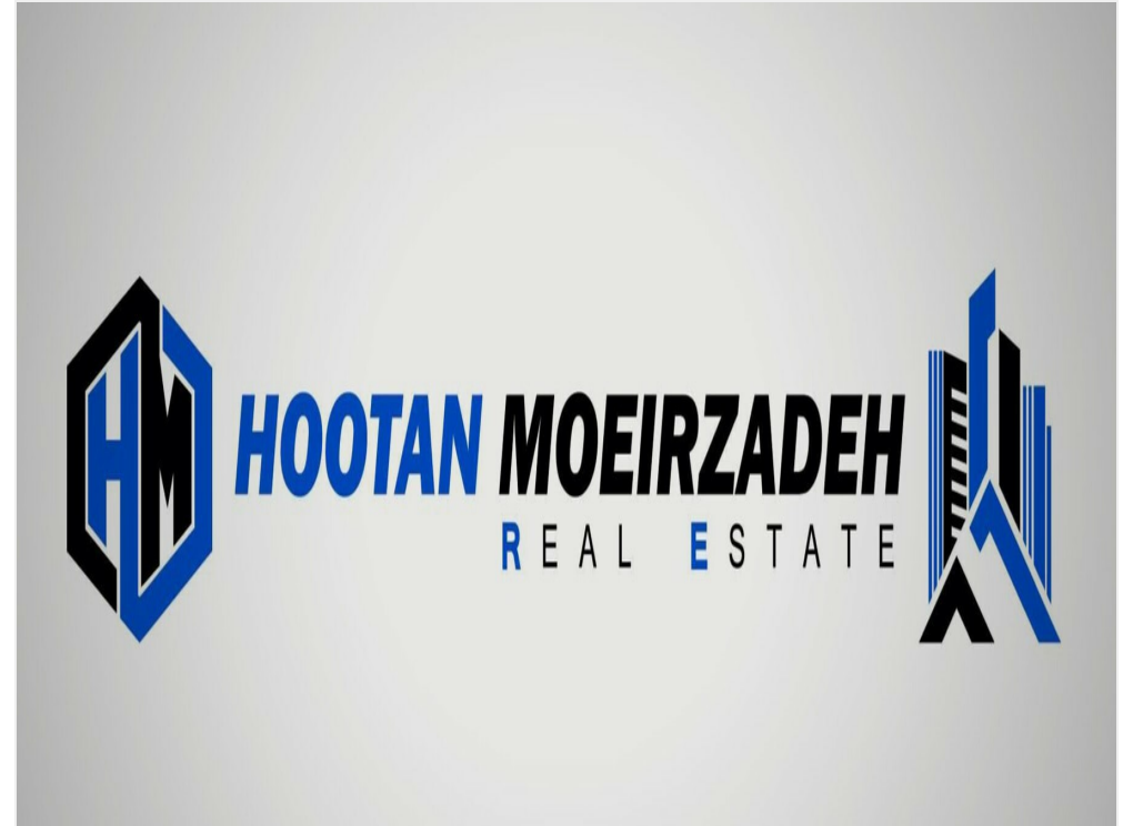
HootanRE Vint HighRes