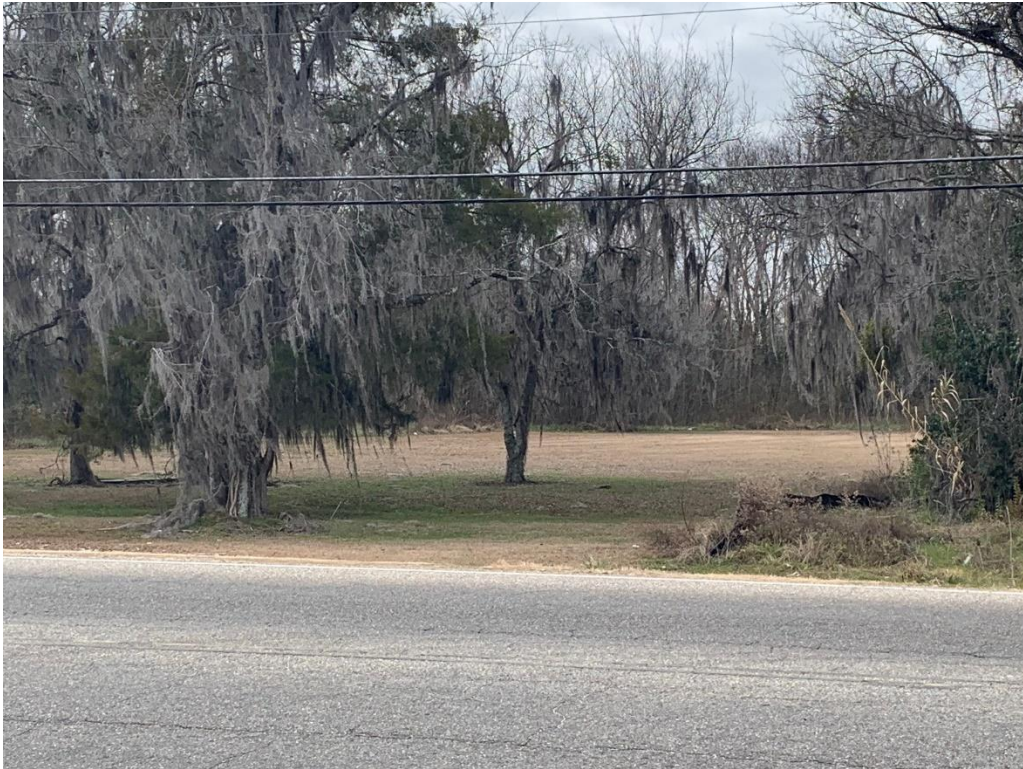
Property as of January 2024