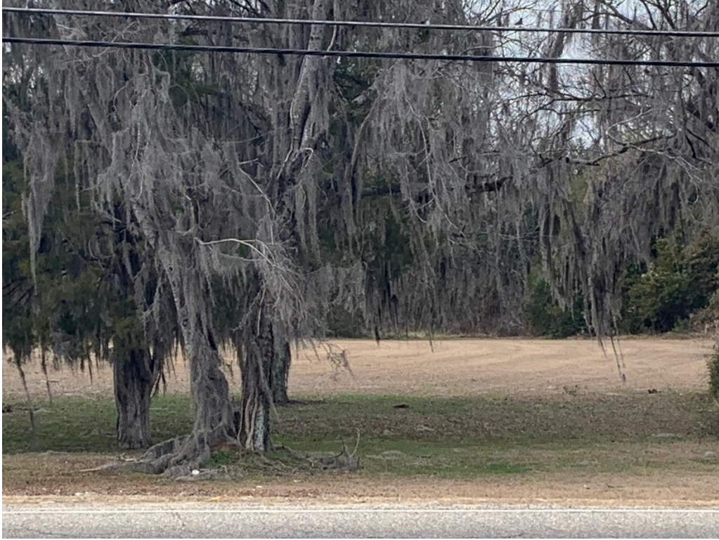
Property as of January 2024