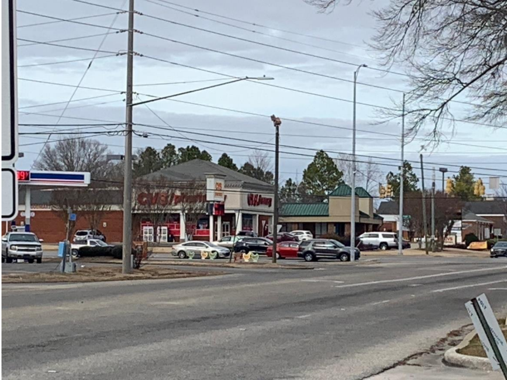
Vaughn & Bell Road Intersection