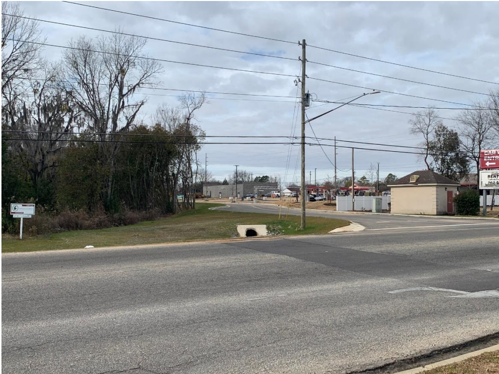
.67 Acre Lot & Car Wash Next Door