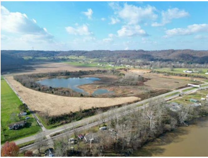
Letart Commerce Park-Photo 2.jpg