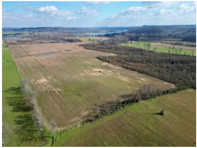
Letart Commerce Park-Photo 3.jpg