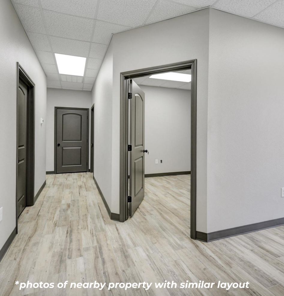
*photos of nearby property with similar layout