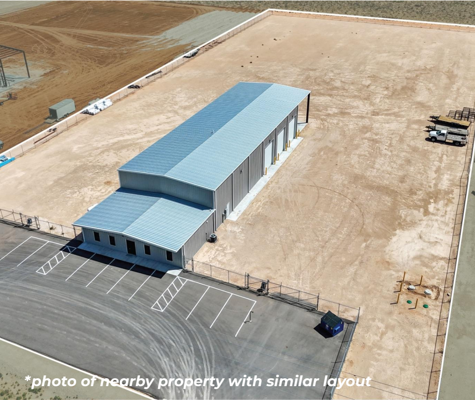
*photo of nearby property with similar layout