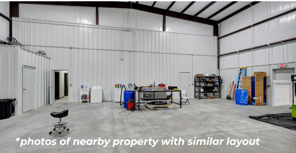
*photos of nearby property with similar layout