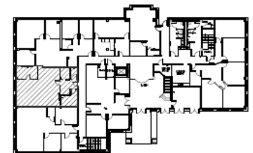
KEYPLAN - 1ST FLOOR