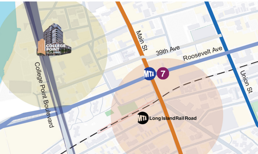
The New Flushing Commercial Center The New Flushing Commercial Center