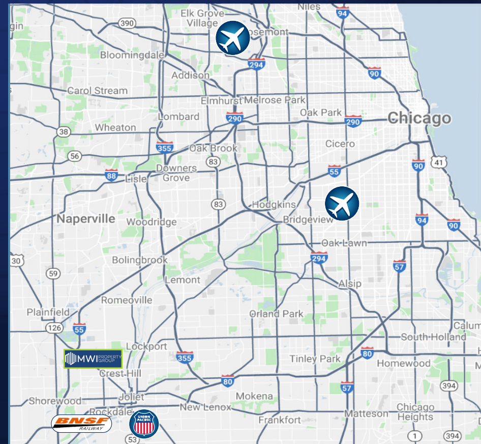
No warranty or representation, expressed or implied, is made as to the accuracy of the information contained herein, and same is submitted subject to error and omission.