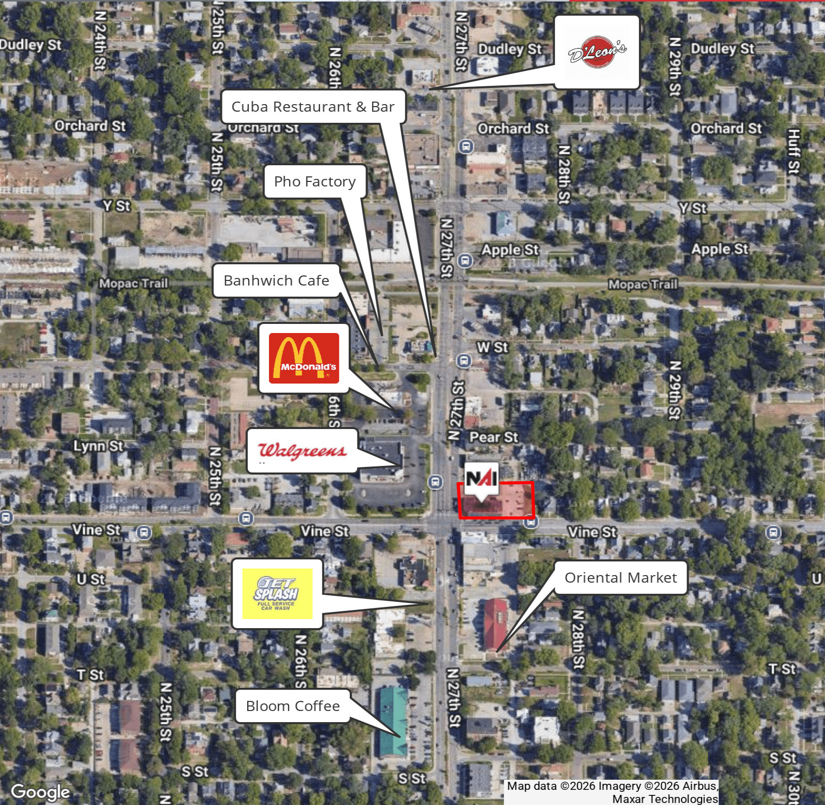
Map data ©2026 Imagery ©2026 Airbus, Maxar Technologies