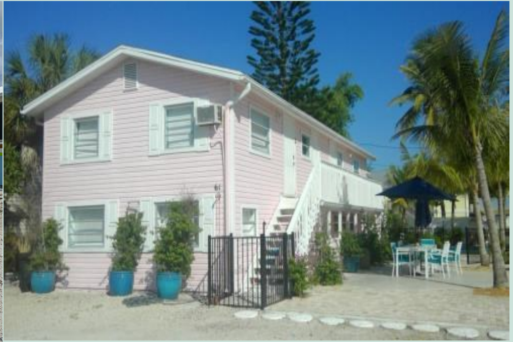
Previous Condition - Pre Hurricane Ian