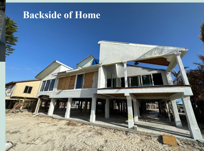
Backside of Home