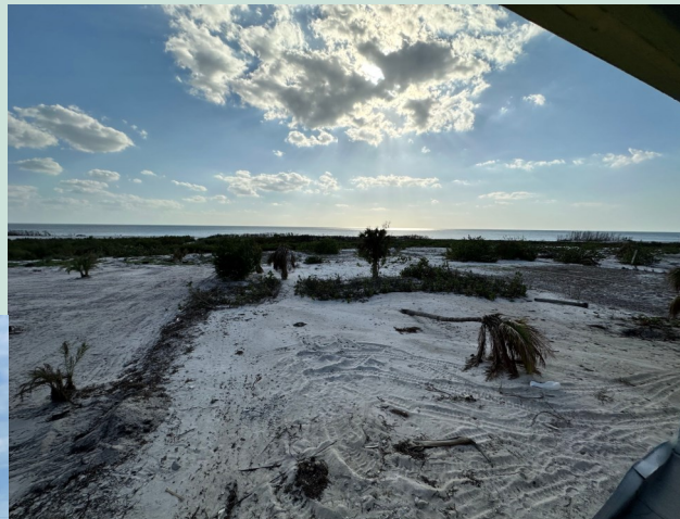
View to Gulf from home