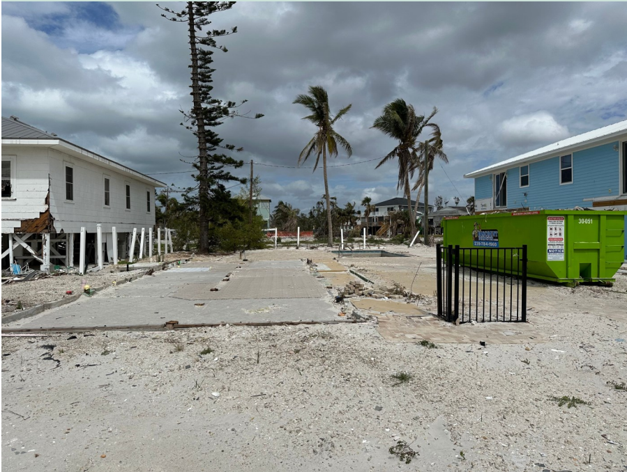
Current Condition - Post Hurricane Ian

CLEAN SLATE: This beachside property is also just steps away from the white sand of Fort Myers Beach on the south end of Estero Island/Fort Myers Beach. The property is now vacant due to Hurricane Ian. Previously, the property was a money-making 3-plex rental unit with six bedrooms, 3 bathrooms and a pool. Currently zoned as residential/multi-family. Property is approximately 60'x 115'. Pad and pool shell remain. This is the ideal location for a custom home or another multi-unit rental property.