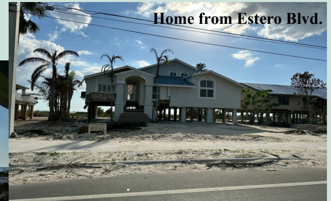
Home from Estero Blvd.