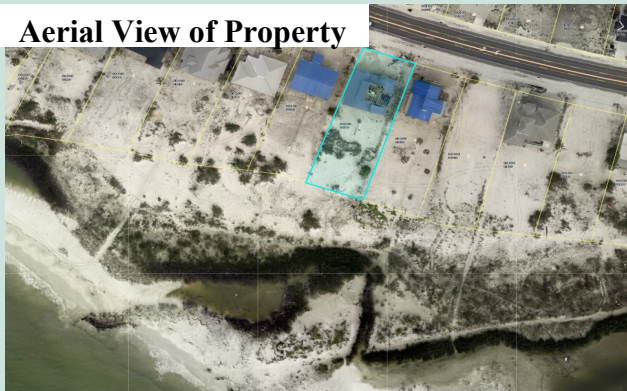
Aerial View of Property