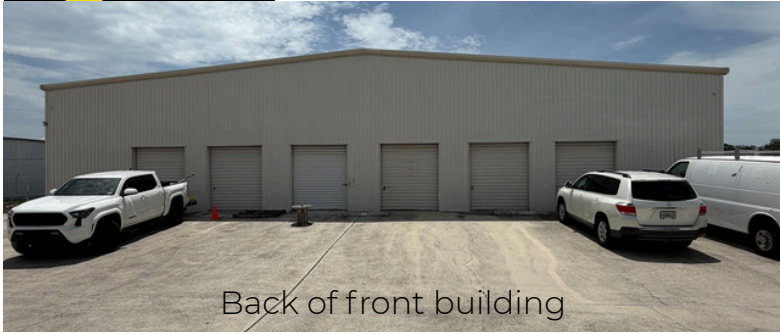
Back of front building