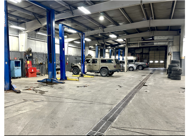
13 work stalls and 9 lifts available for purchase