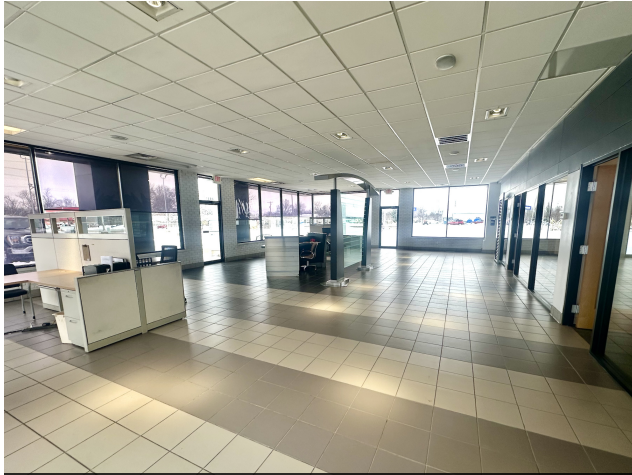
Beautiful showroom with lots of natural light