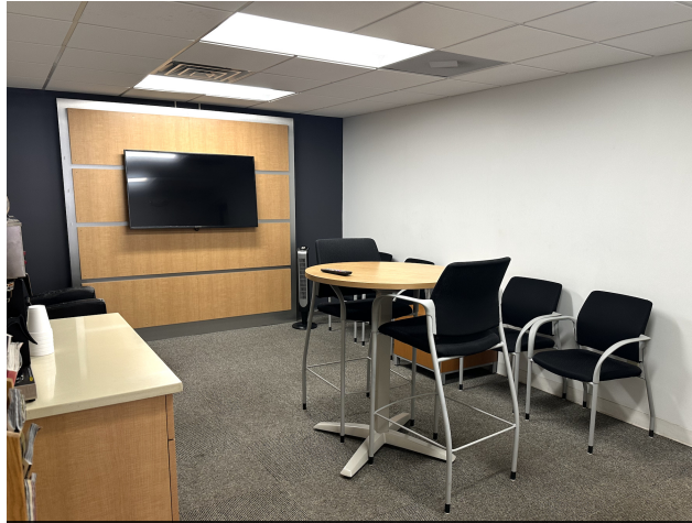
Employee breakroom or training area