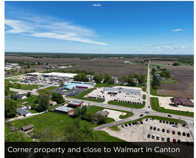
Corner property and close to Walmart in Canton