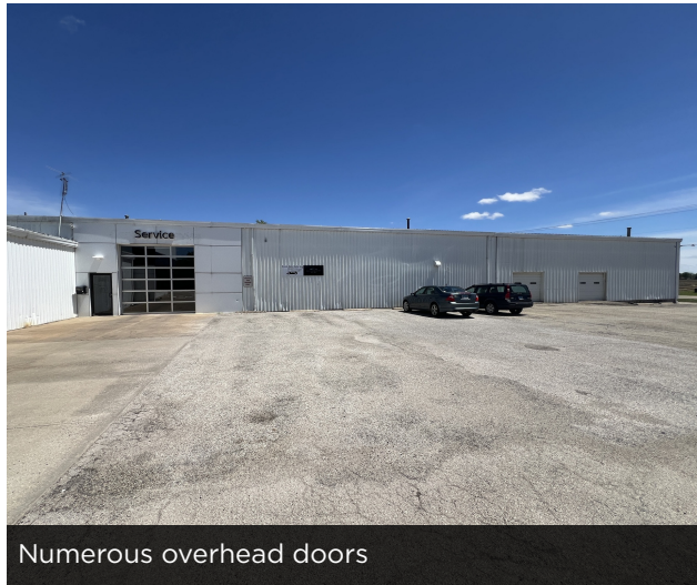
Numerous overhead doors