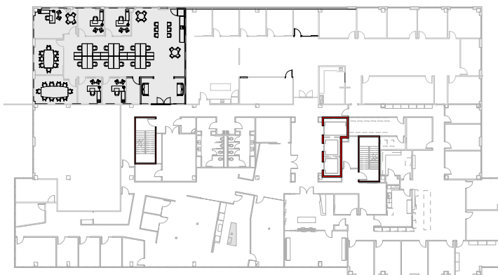
② DEMOLITION PLAN - THIRD LEVEL 1/8" = 1'-0"

RELOCATE TRANSFORMER + EXISTING PANEL TO THIS LOCATION