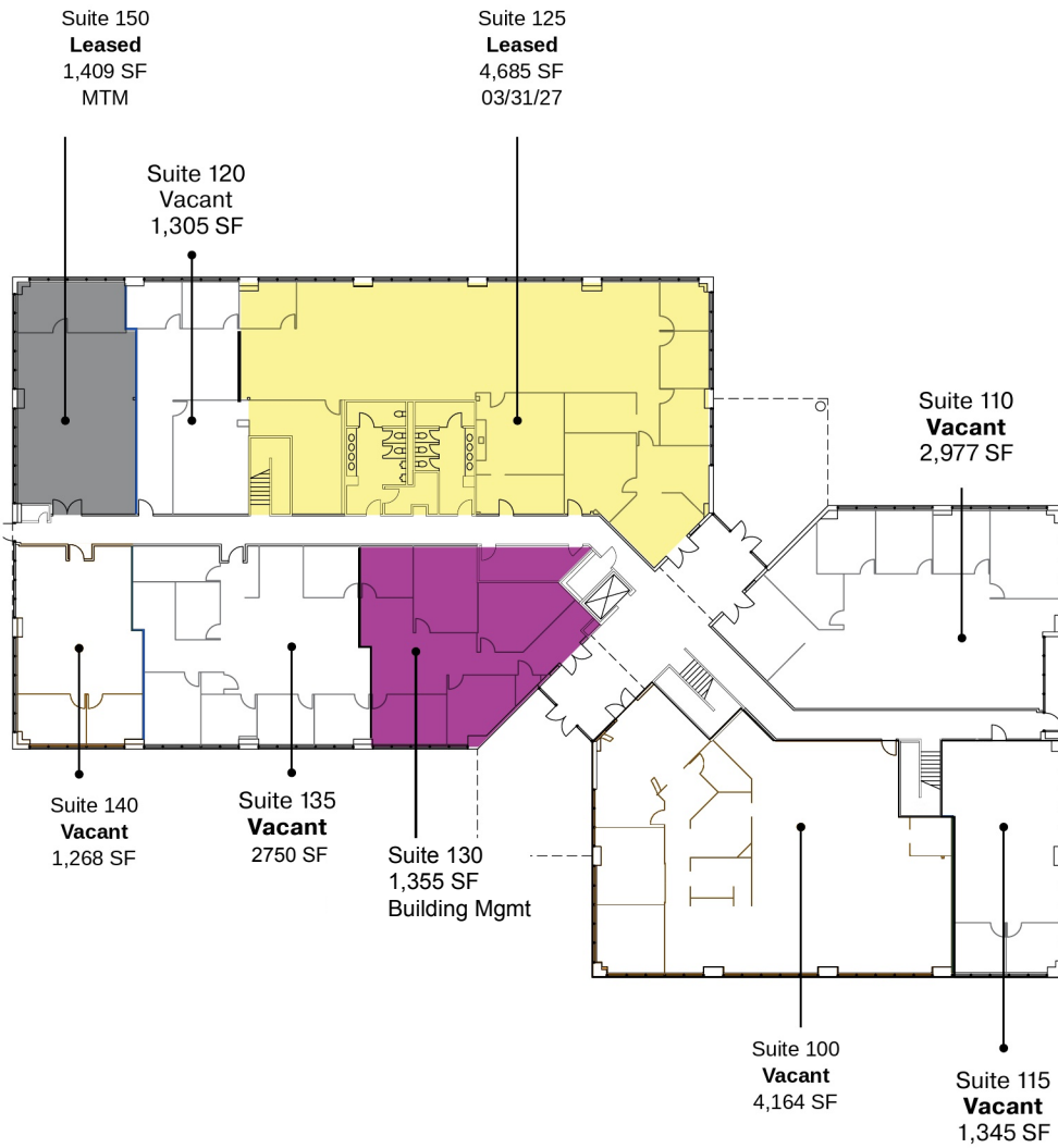
1 First Floor