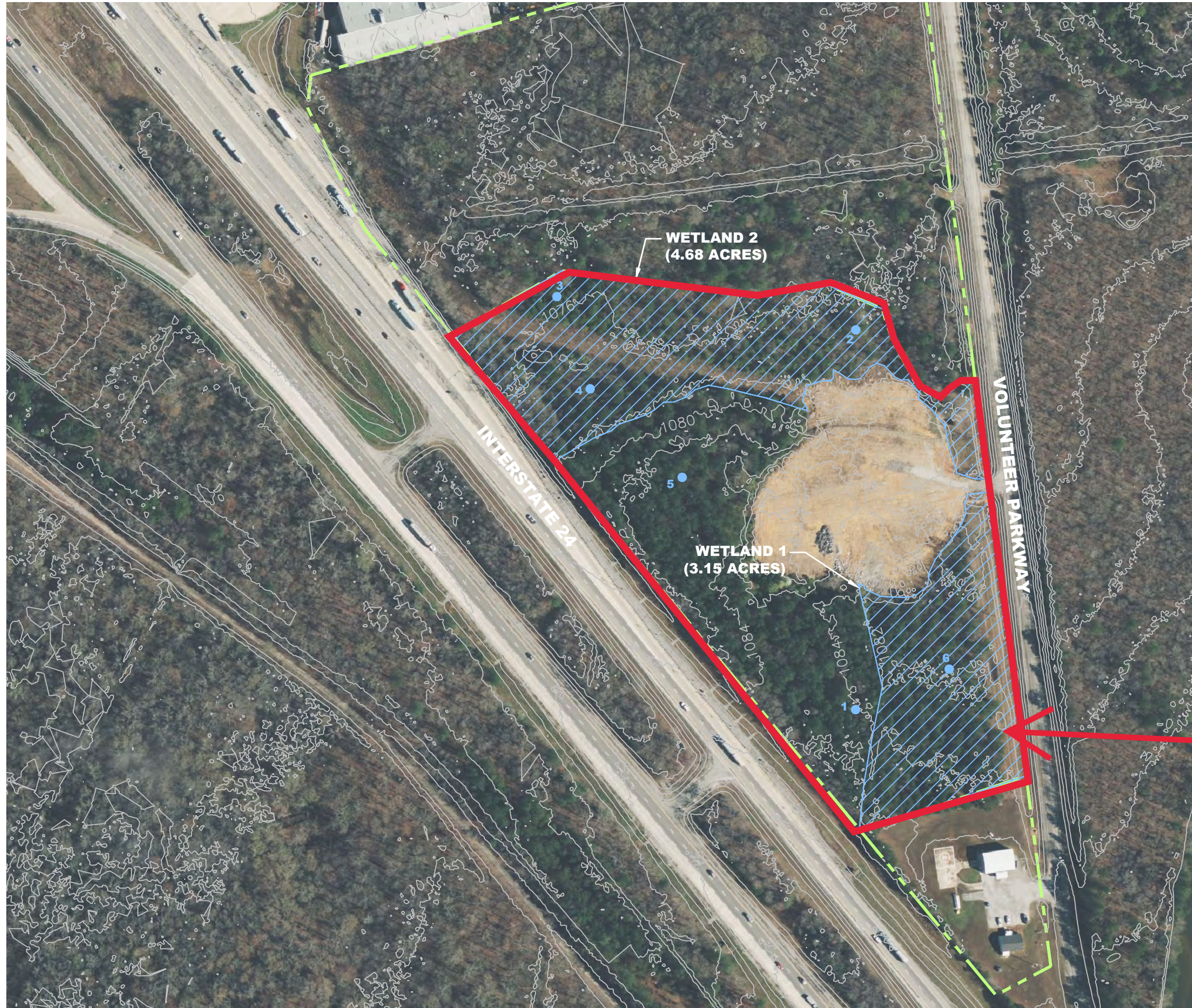
Figure 10, Site Map