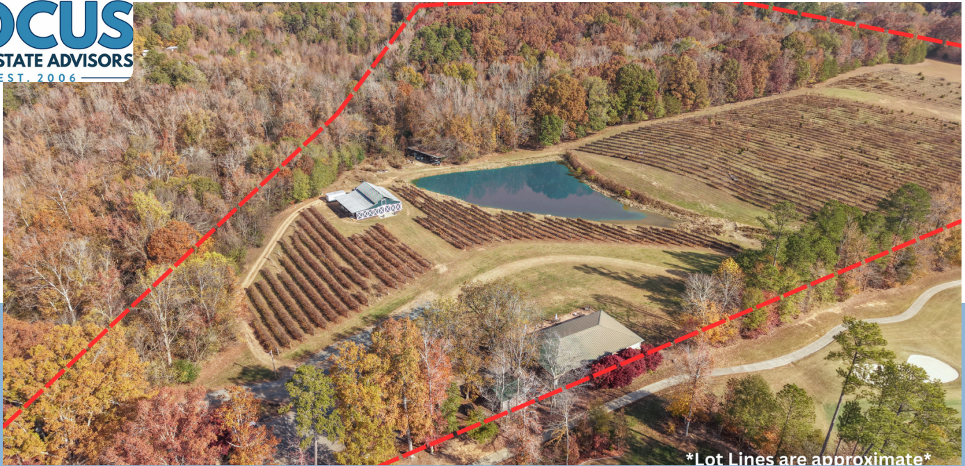
*Lot Lines are approximate*