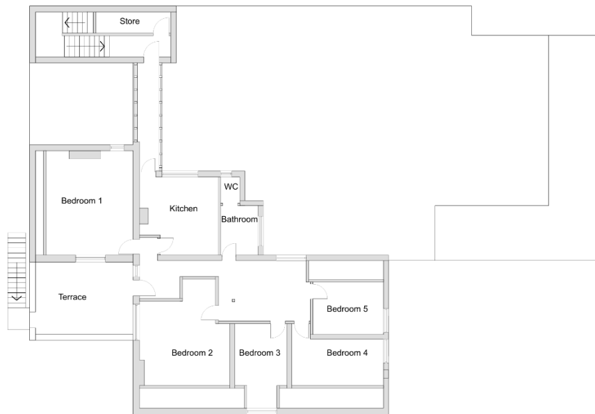
First Floor Plan As Existing Scale 1:100

NOTES: Any errors or omissions to be reported to Code L6 immediately. This drawing and design is the copyright of Code L6 and is not to be used for any purpose without their consent.