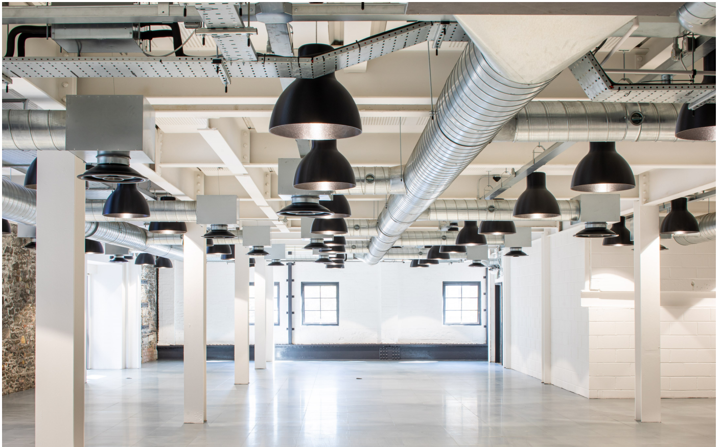
NB - Above photo taken in 2019 before the current tenant's occupation.