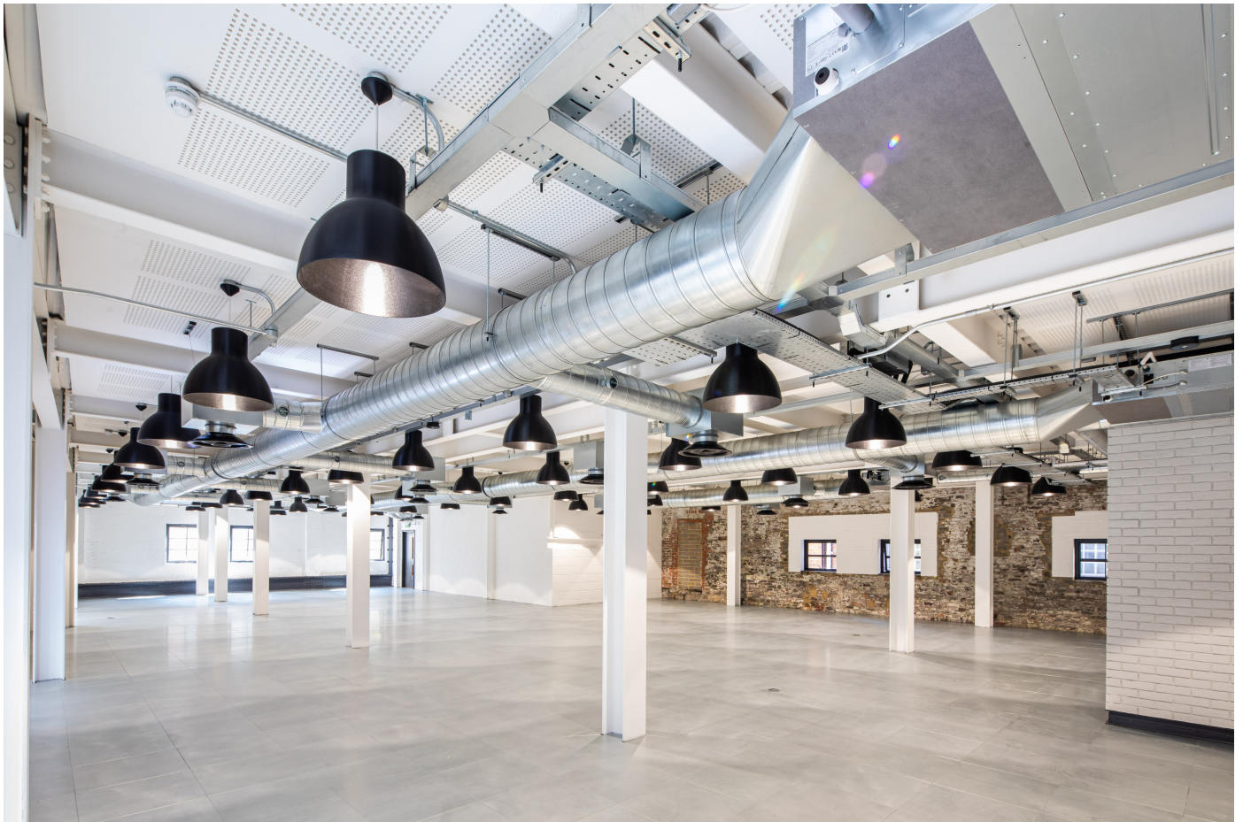
NB - Above photo taken in 2019 before the current tenant's occupation.