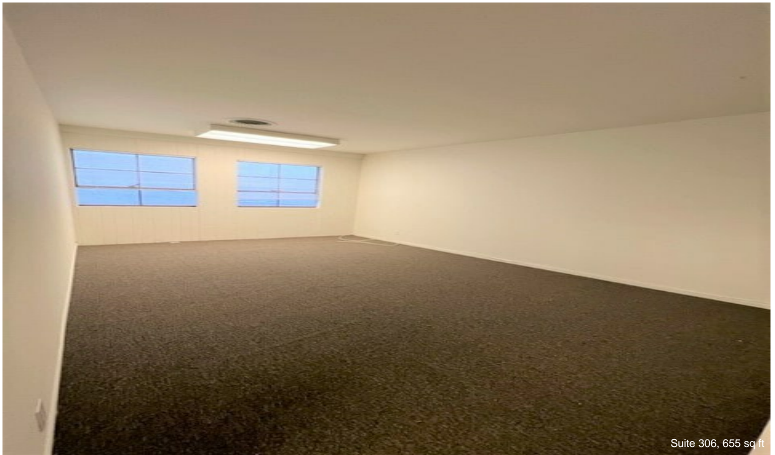
Suite 306, 655 sq ft