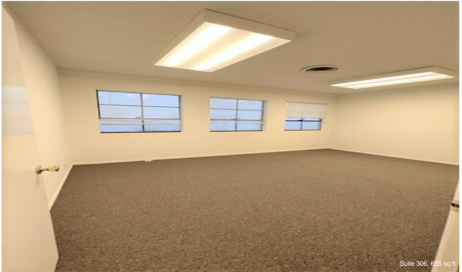
Suite 306, 655 sq ft