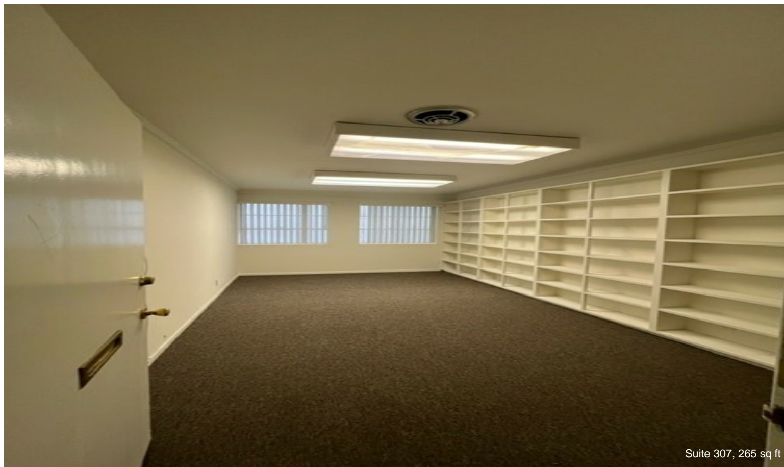
Suite 307, 265 sq ft