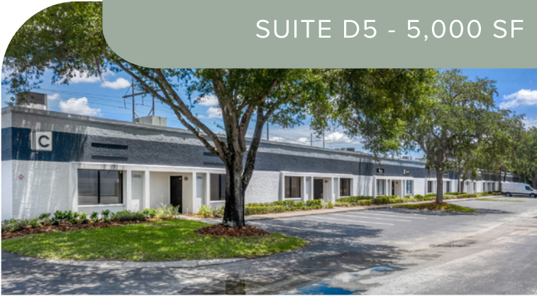
SUITE D5 - 5,000 SF

11816-11818 RACE TRACK RD, I TAMPA, FL 33626 SUITE D5