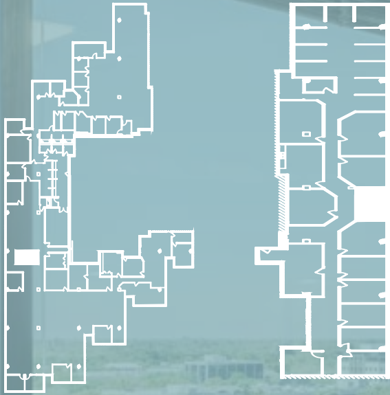
Suite 500/502: 28,858SF