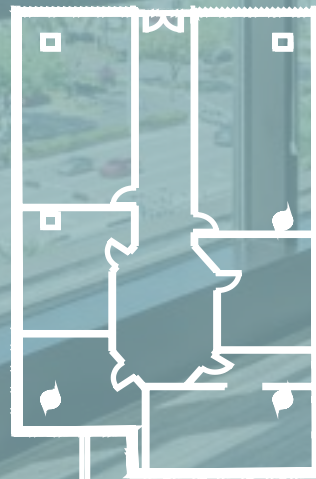
Suite 1000: 4,370 SF