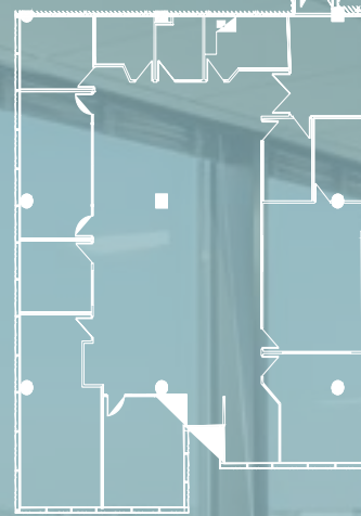
Suite 625: 4,771 SF