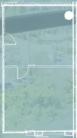
Suite 718: 563 SF