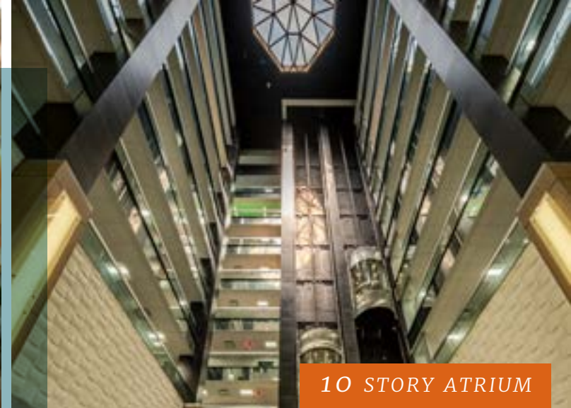
10 STORY ATRIUM