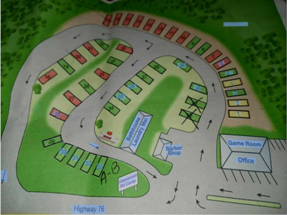
RV Campground Map