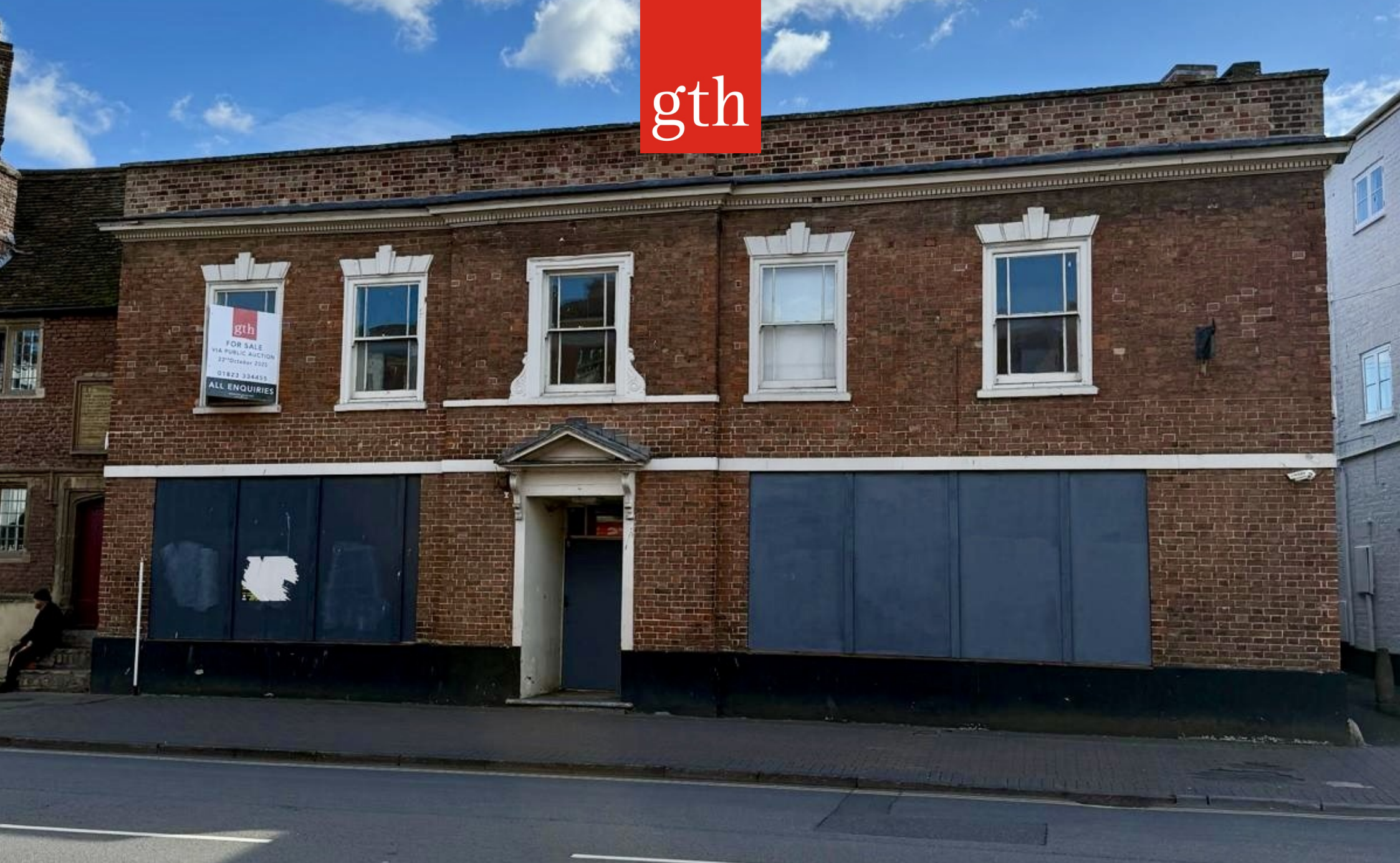
48 East Street, Taunton