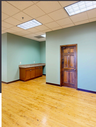
MULTIPLE PRIVATE OFFICES