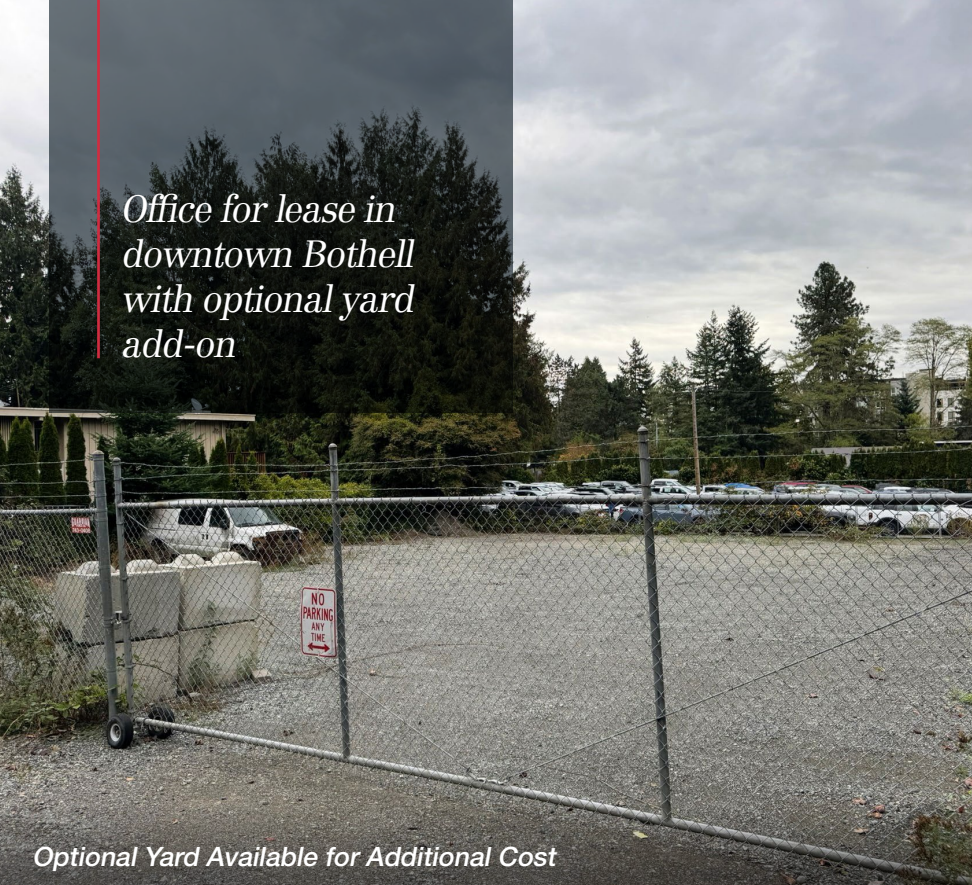
Optional Yard Available for Additional Cost

Office for lease in downtown Bothell with optional yard add-on