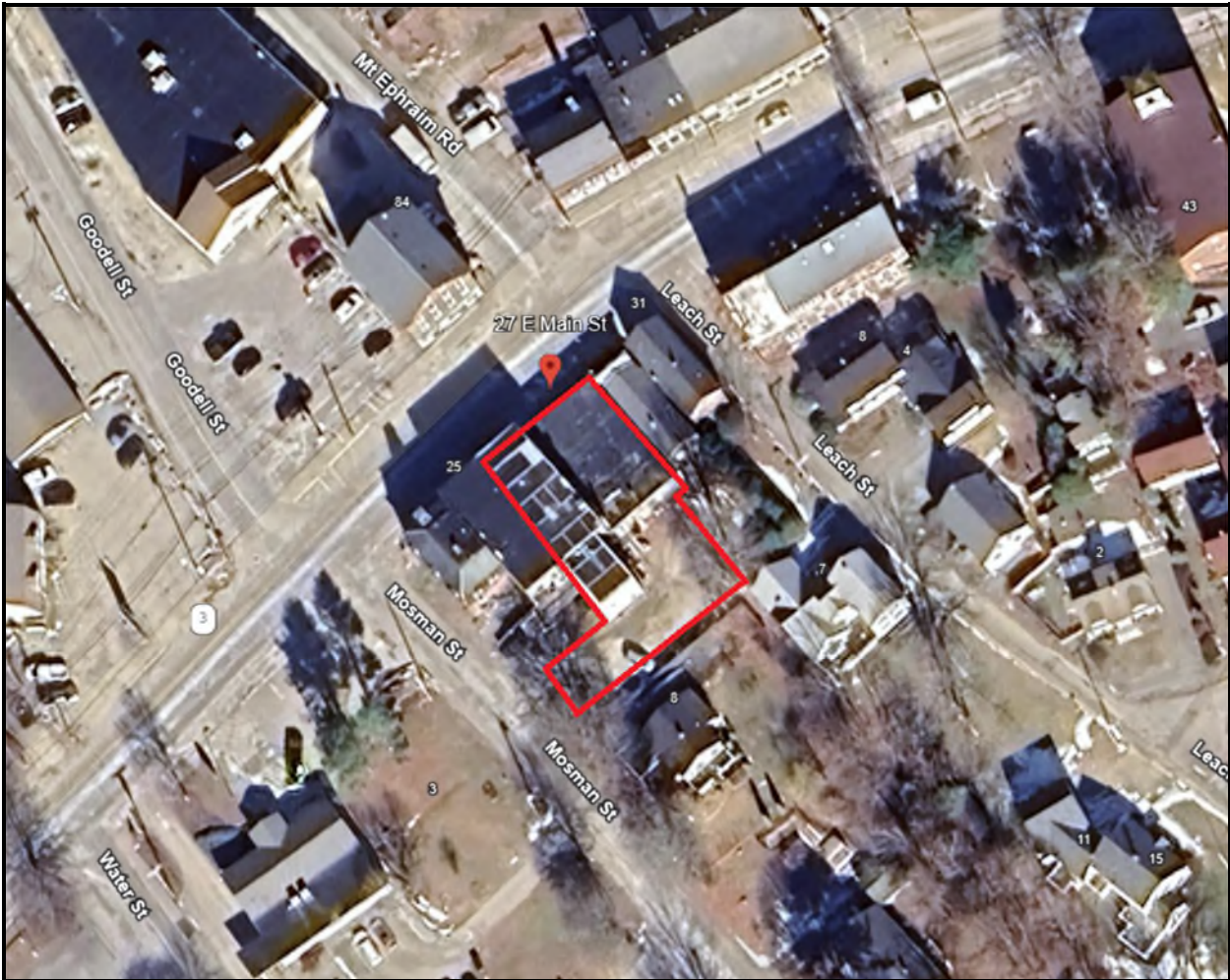
Aerial View of the Subject