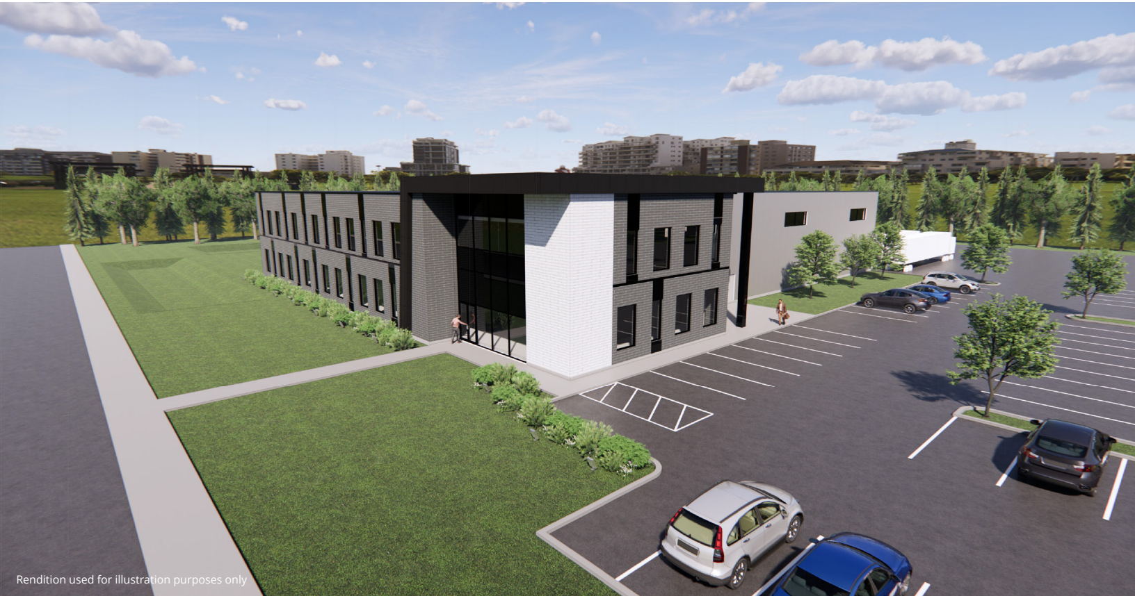
Rendition used for illustration purposes only