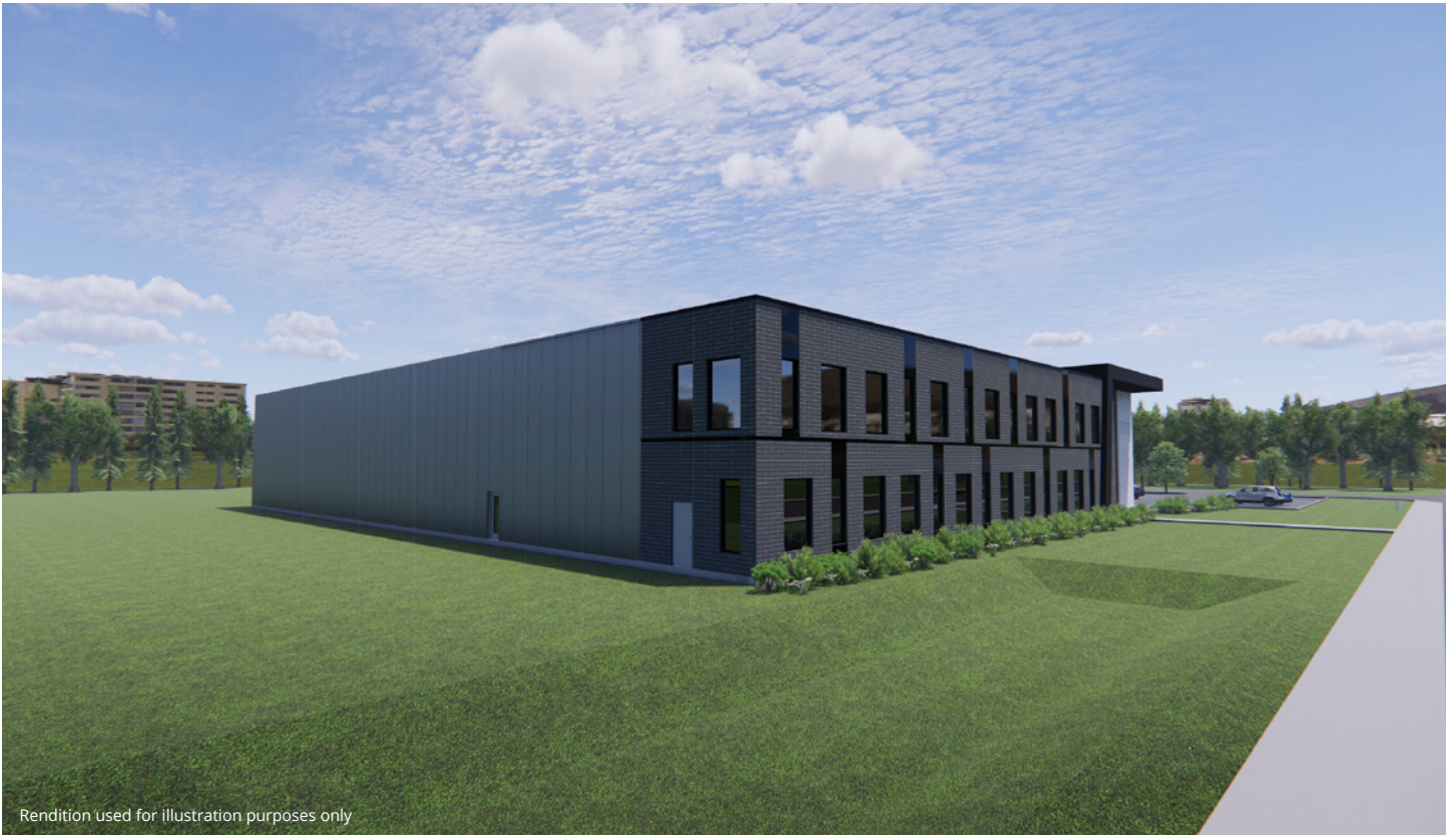
Rendition used for illustration purposes only