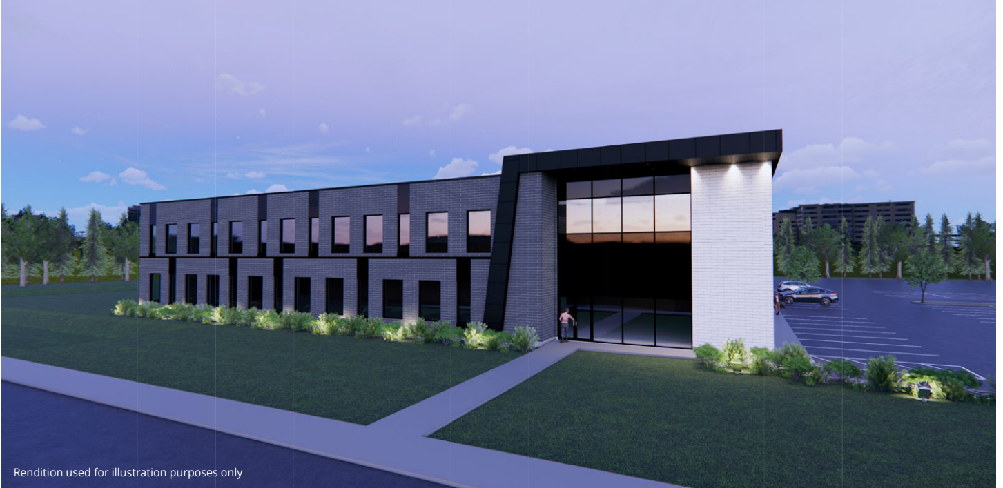
Rendition used for illustration purposes only