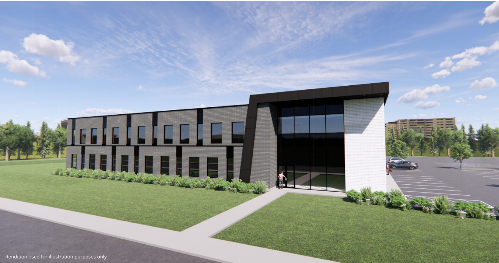
Rendition used for illustration purposes only