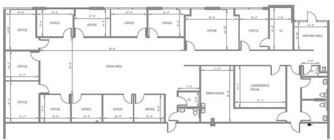
SUITE 3610 OFFICE 4,460 SF