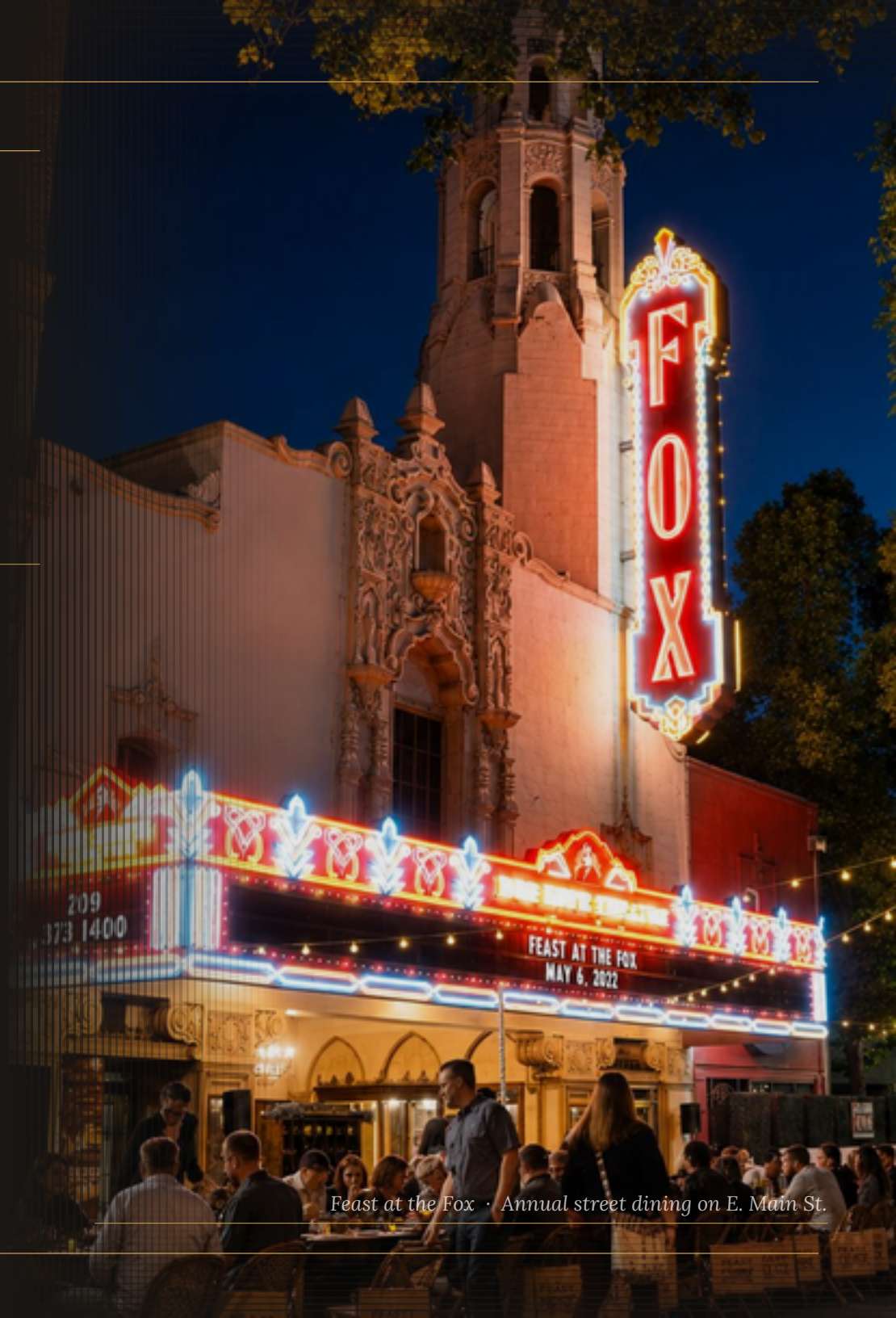
Feast at the Fox · Annual street dining on E. Main St.