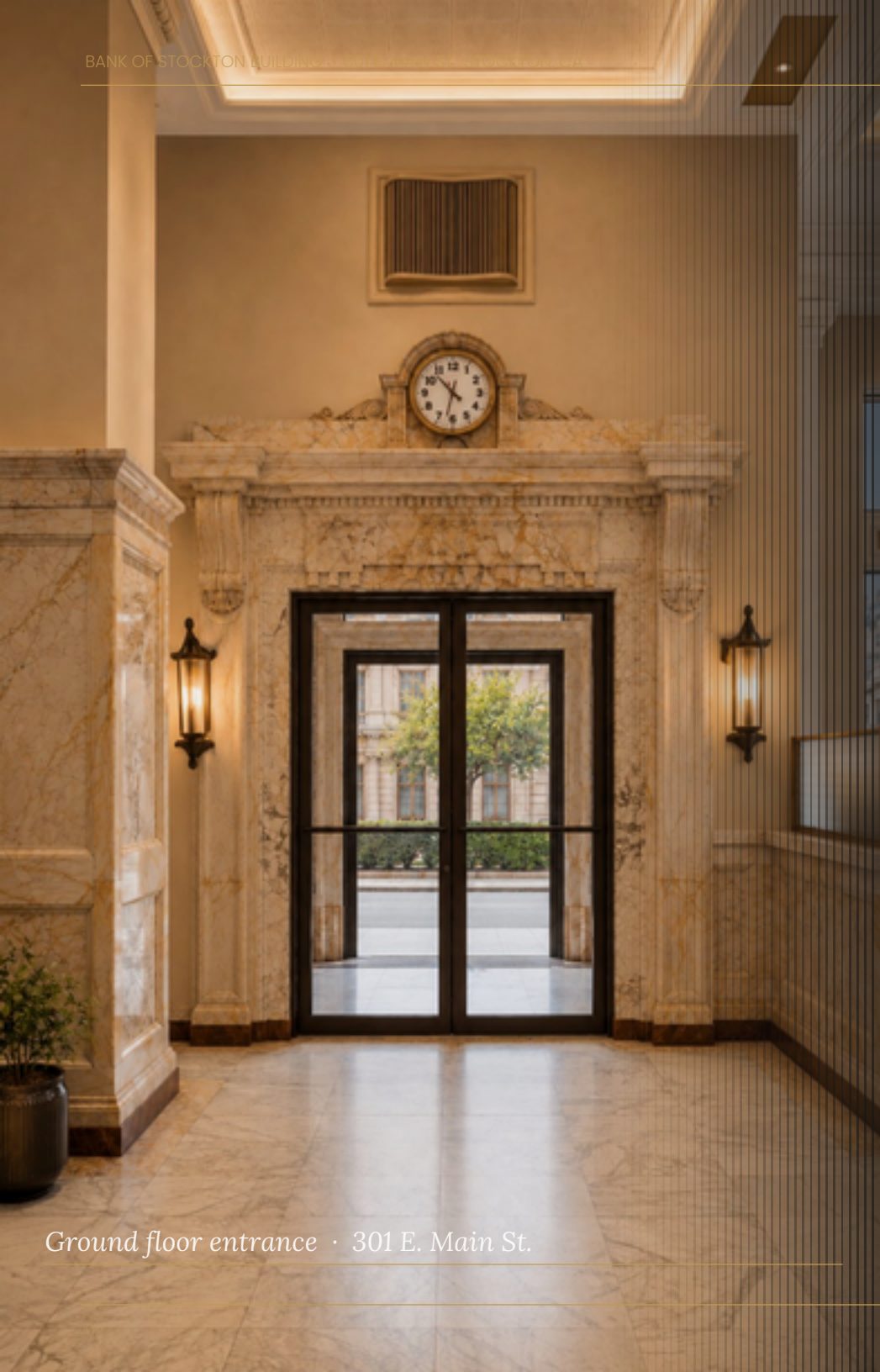
Ground floor entrance • 301 E. Main St.