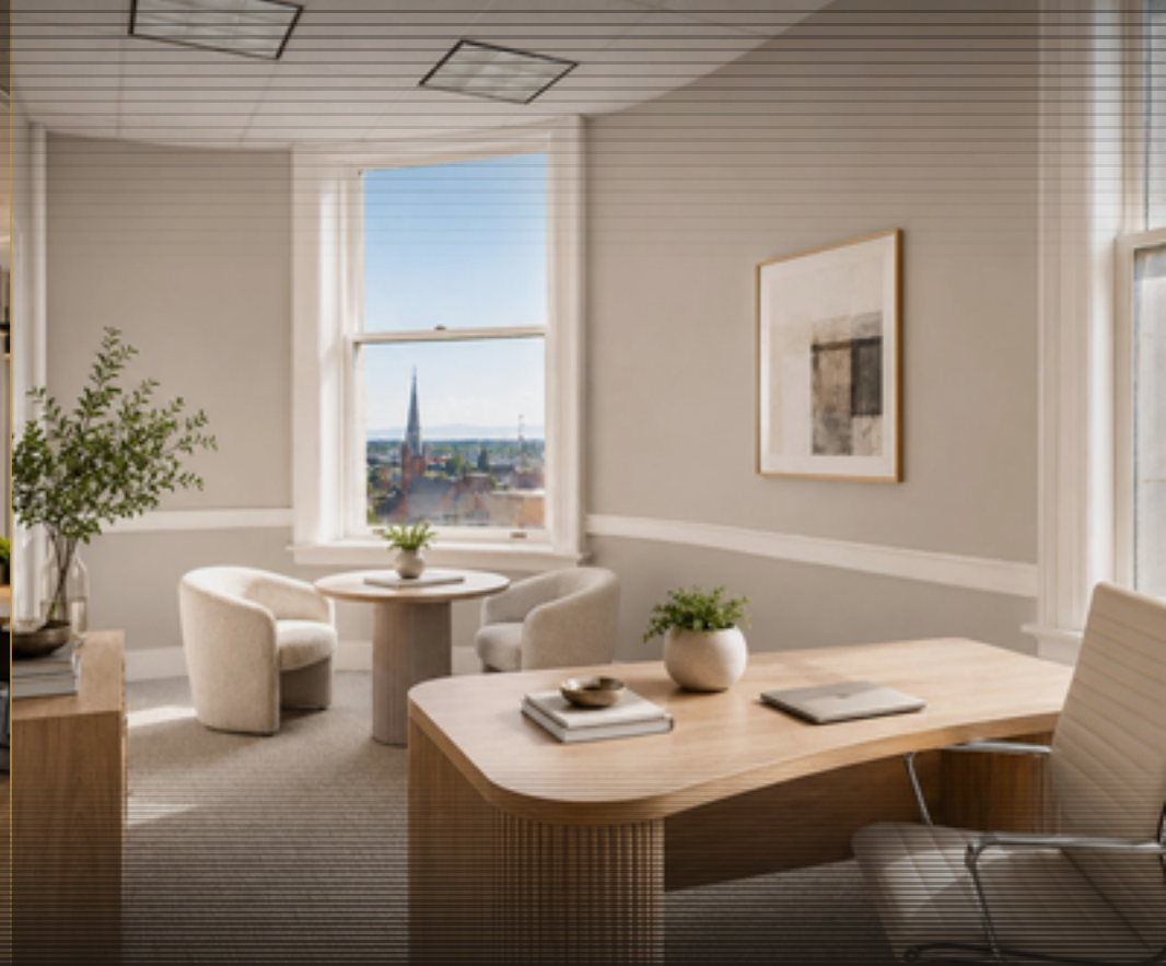
6TH FLOOR CORNER OFFICE · RENDER