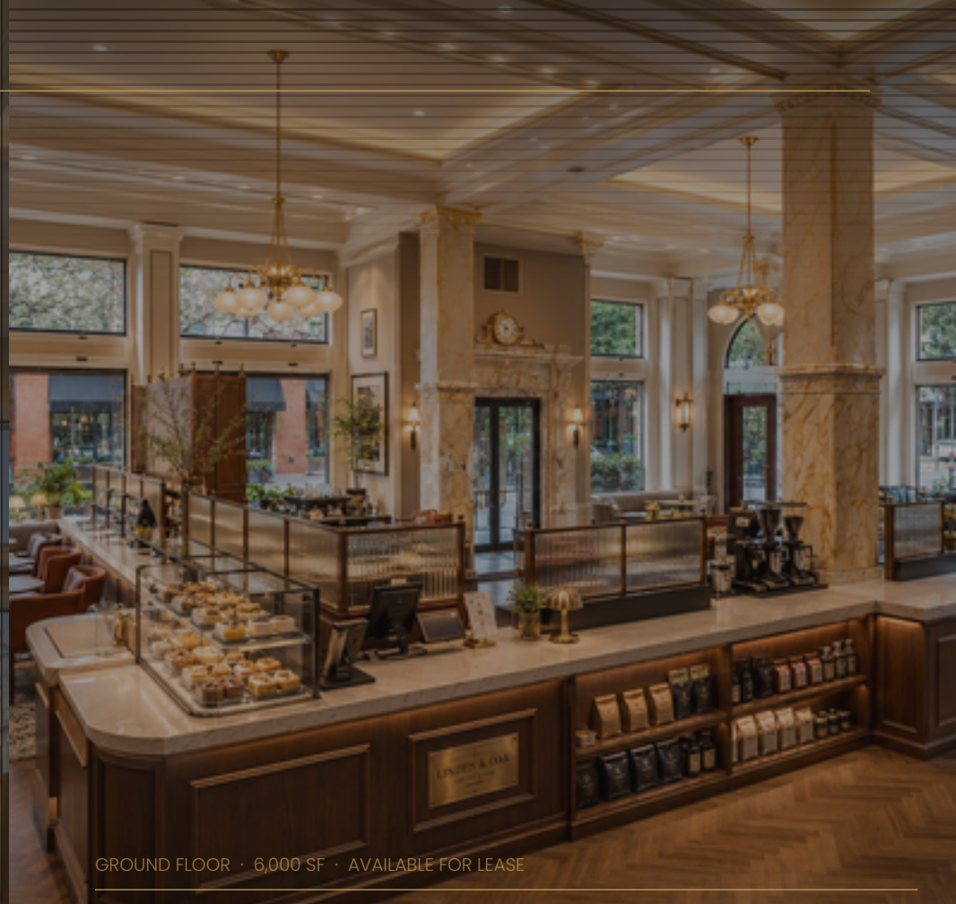
GROUND FLOOR • 6,000 SF • AVAILABLE FOR LEASE