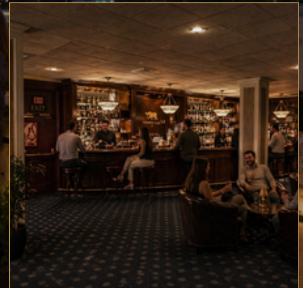
THE BAR · YOSEMITE CLUB

Building tenants receive preferred access and special membership incentives at the Yosemite Club — ask us for details.