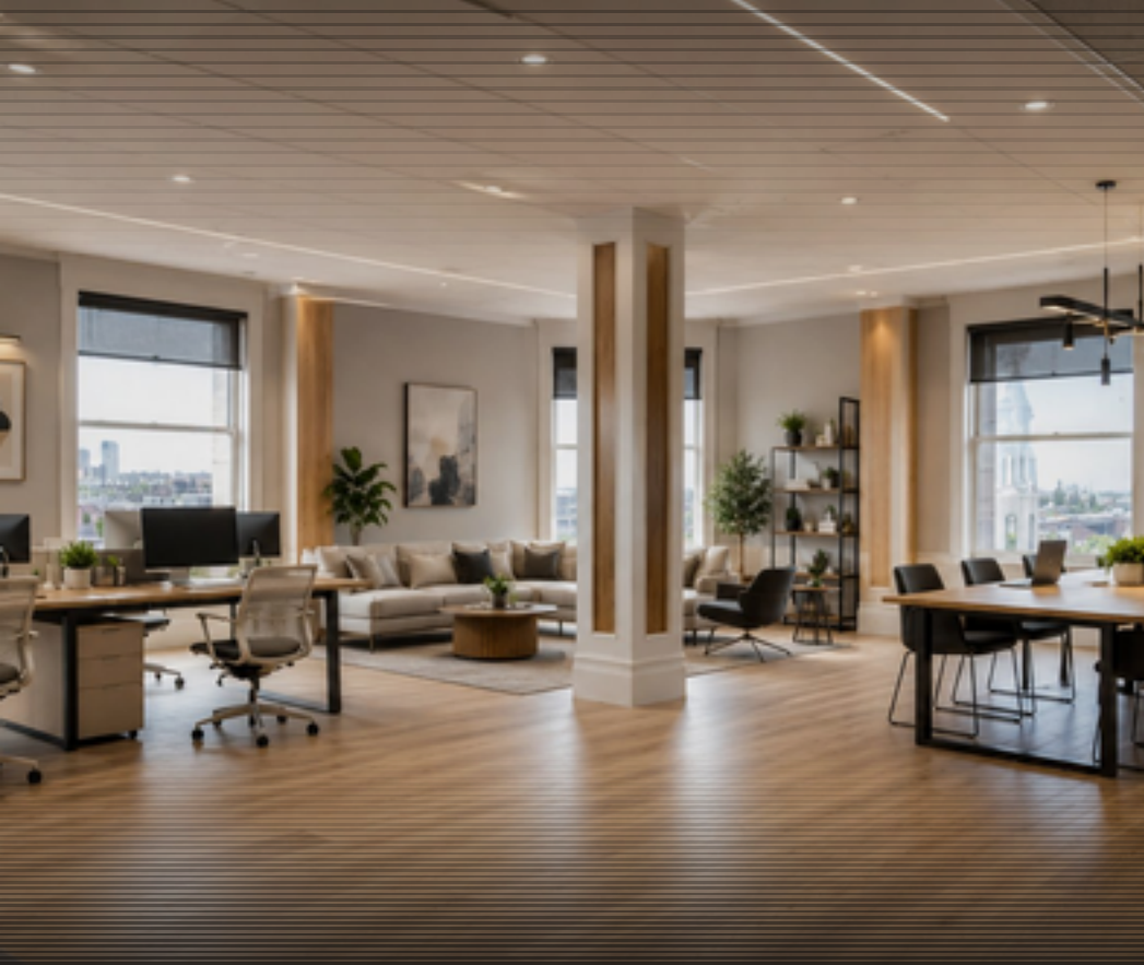
OPEN OFFICE FLOOR · RENDER