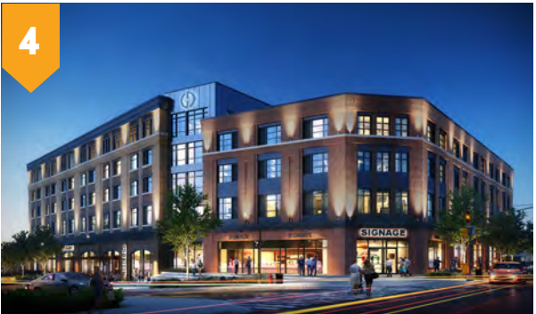
4 OPEN Origin Hotel 125-room boutique hotel/15k s.f. retail