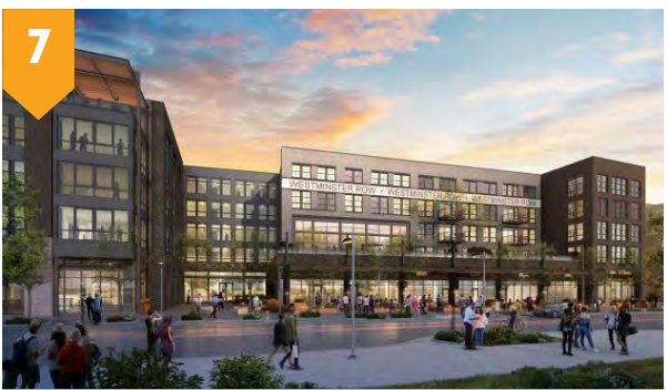
7 OPEN Westminster Row 274 units/17k s.f. retail