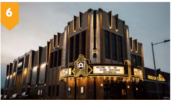
6 OPEN Alamo Drafthouse 9-screen theater/restaurant