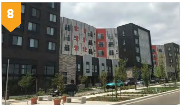
8 OPEN 8877 Eaton 118 units/27k s.f. retail