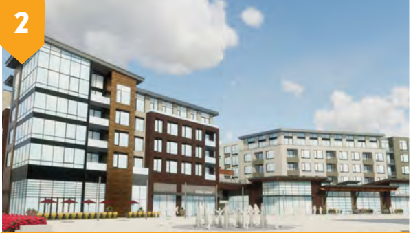
2 OPEN Aspire Westminister 226 units/38k s.f. retail