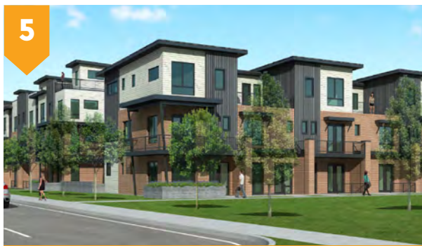
5 OPENING Q3 2022 Townhomes on Harlan 34-townhomes