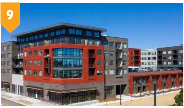
9 OPEN Ascent Westminster 255 units/22k s.f. retail