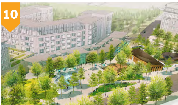
10 OPEN Central Square 1.2 acre plaza