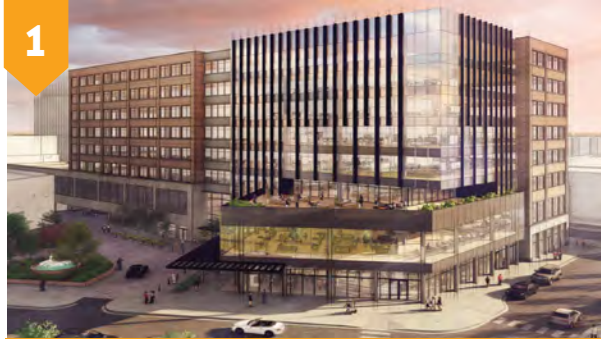
1 OPENING Q3 2024 Schnitzer West Phase I 200,000 s.f. office/8,000 retail