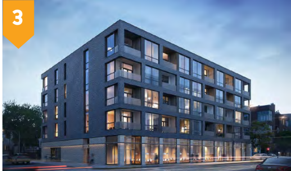
3 FUTURE TOWNHOMES & CONDOMINIUMS Downtown Westminster Residences