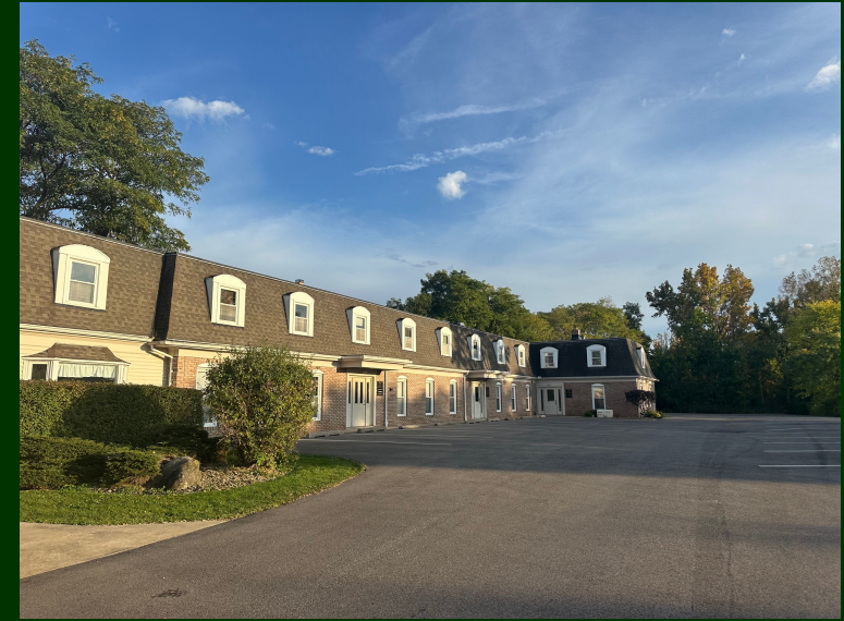
8437 Mayfield Rd., Chesterland, OH 44026

No warranty or representation, express or implied, is made as to the accuracy of the information contained herein. It is submitted subject to errors, omissions, price changes, rental or other conditions, withdrawal without notice, and to any special listing conditions imposed by our client.