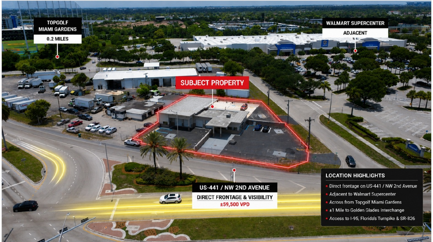
Aerial view. Subject property fronts US-441 / NW 2nd Avenue, directly across from Topgolf Miami Gardens and adjacent to a Walmart Supercenter.

This site sits along one of North Miami's most heavily traveled retail and entertainment corridors. Direct frontage on US-441 / NW 2nd Avenue places the property across from Topgolf Miami Gardens and immediately adjacent to a Walmart Supercenter , with quick access to the Golden Glades Interchange , I-95, Florida's Turnpike , and SR-826 — giving automotive, marine, and industrial users excellent visibility along with regional reach.