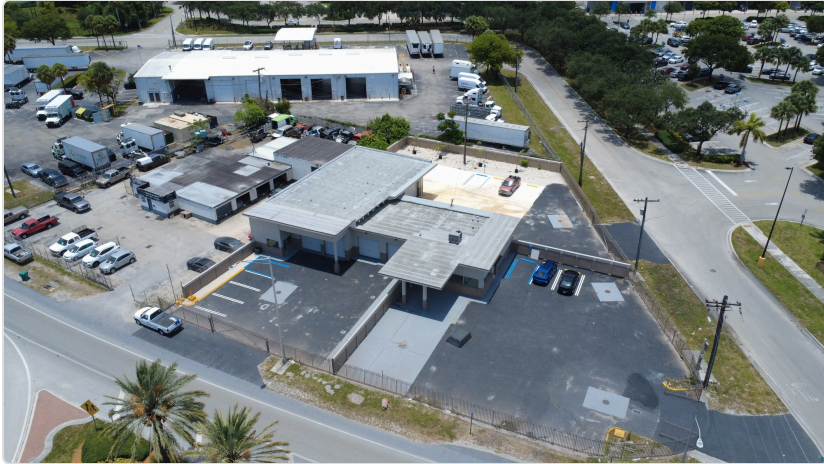
Aerial view. Subject property fronts NW 2nd Avenue near the Golden Glades Interchange.