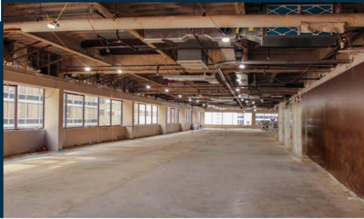
COLUMN-FREE, OPEN FLOOR