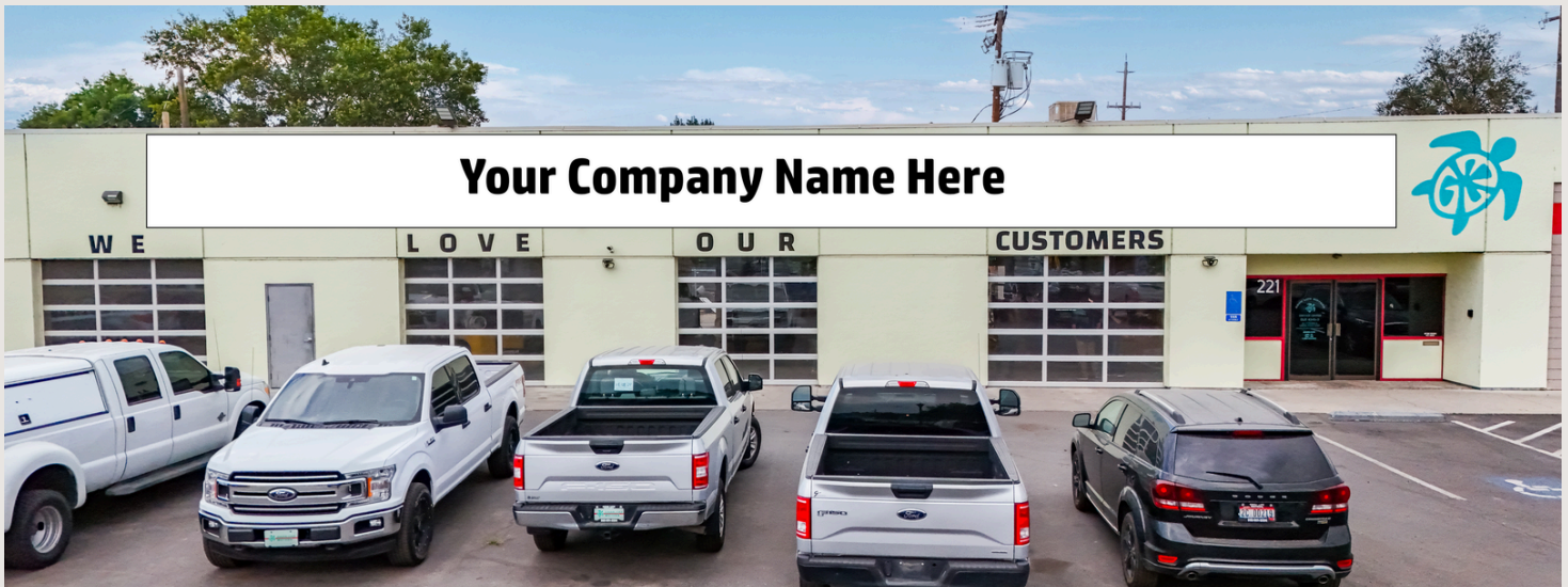
6000 sq ft shop with bathroom, office, waiting area. 10 bays