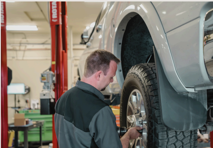
7 Lifts and all shop equipment may be additionally purchased