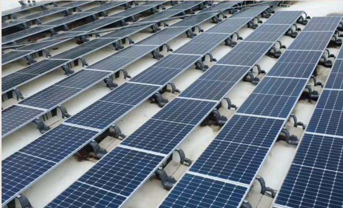
Large Solar Power System