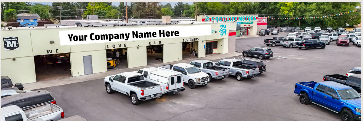
120' x 50' space allows for 7 lifts + 3 flat bays.