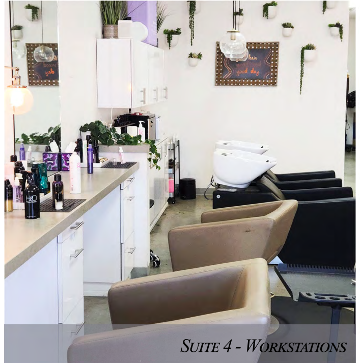
SUITE 4 - WORKSTATIONS