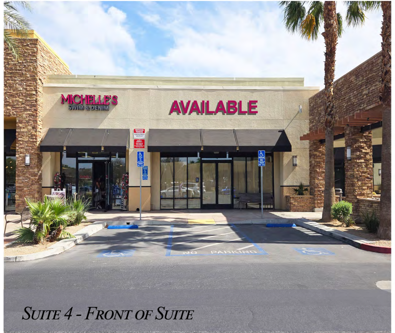
SUITE 4 - FRONT OF SUITE