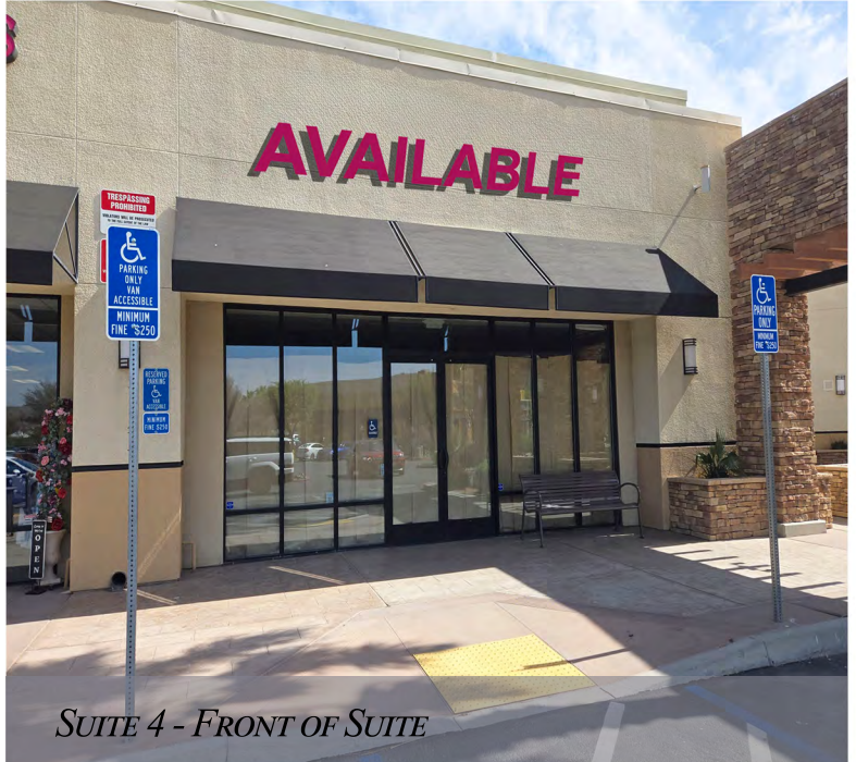
SUITE 4 - FRONT OF SUITE