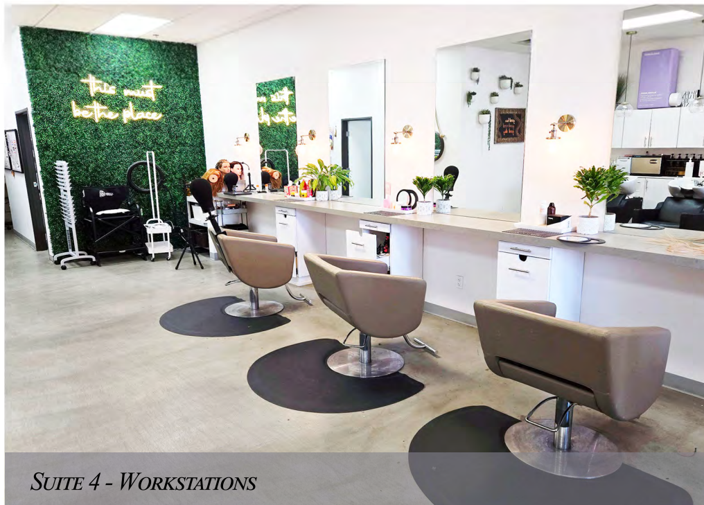
SUITE 4 - WORKSTATIONS