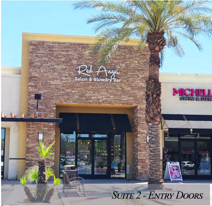
SUITE 2 - ENTRY DOORS