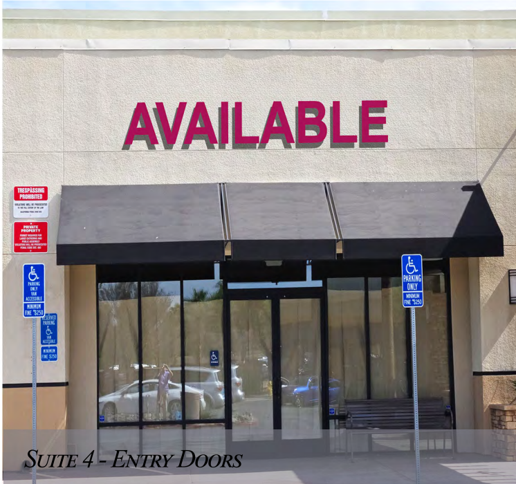
SUITE 4 - ENTRY DOORS