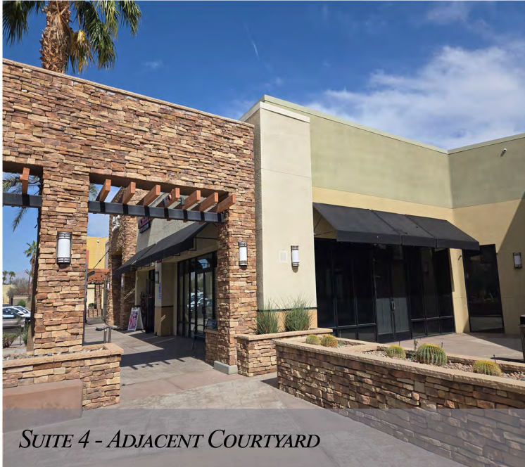
SUITE 4 - ADJACENT COURTYARD