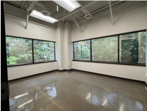
Single Office - 15' 4" x 12' 4"