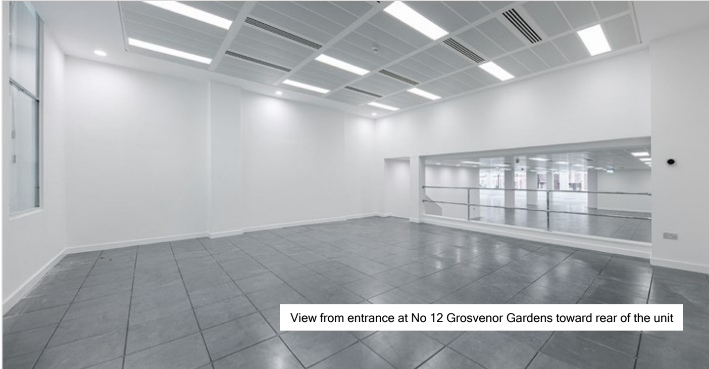
View from entrance at No 12 Grosvenor Gardens toward rear of the unit