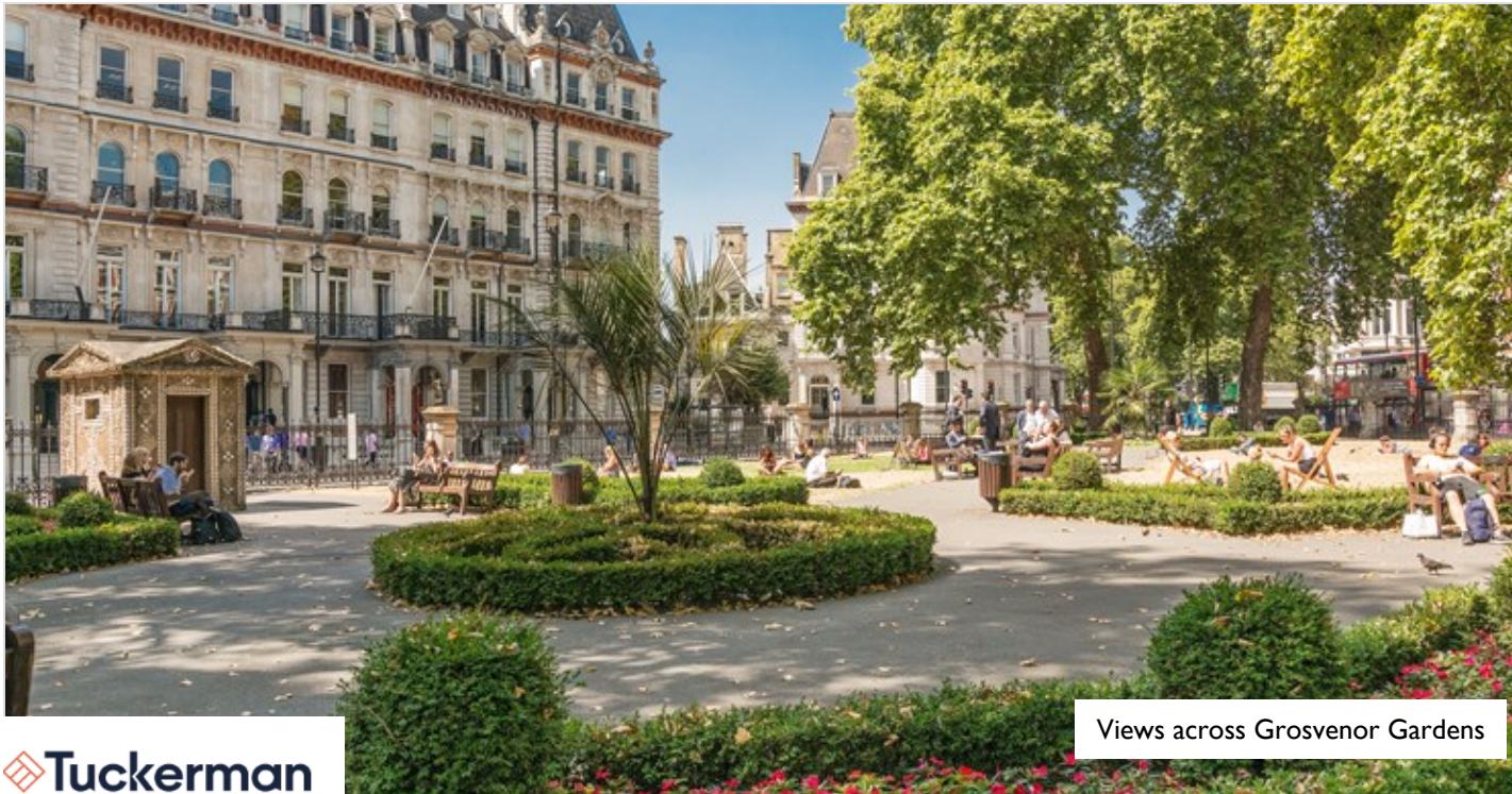
Views across Grosvenor Gardens