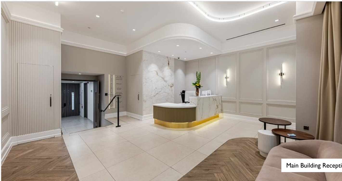
Main Building Reception